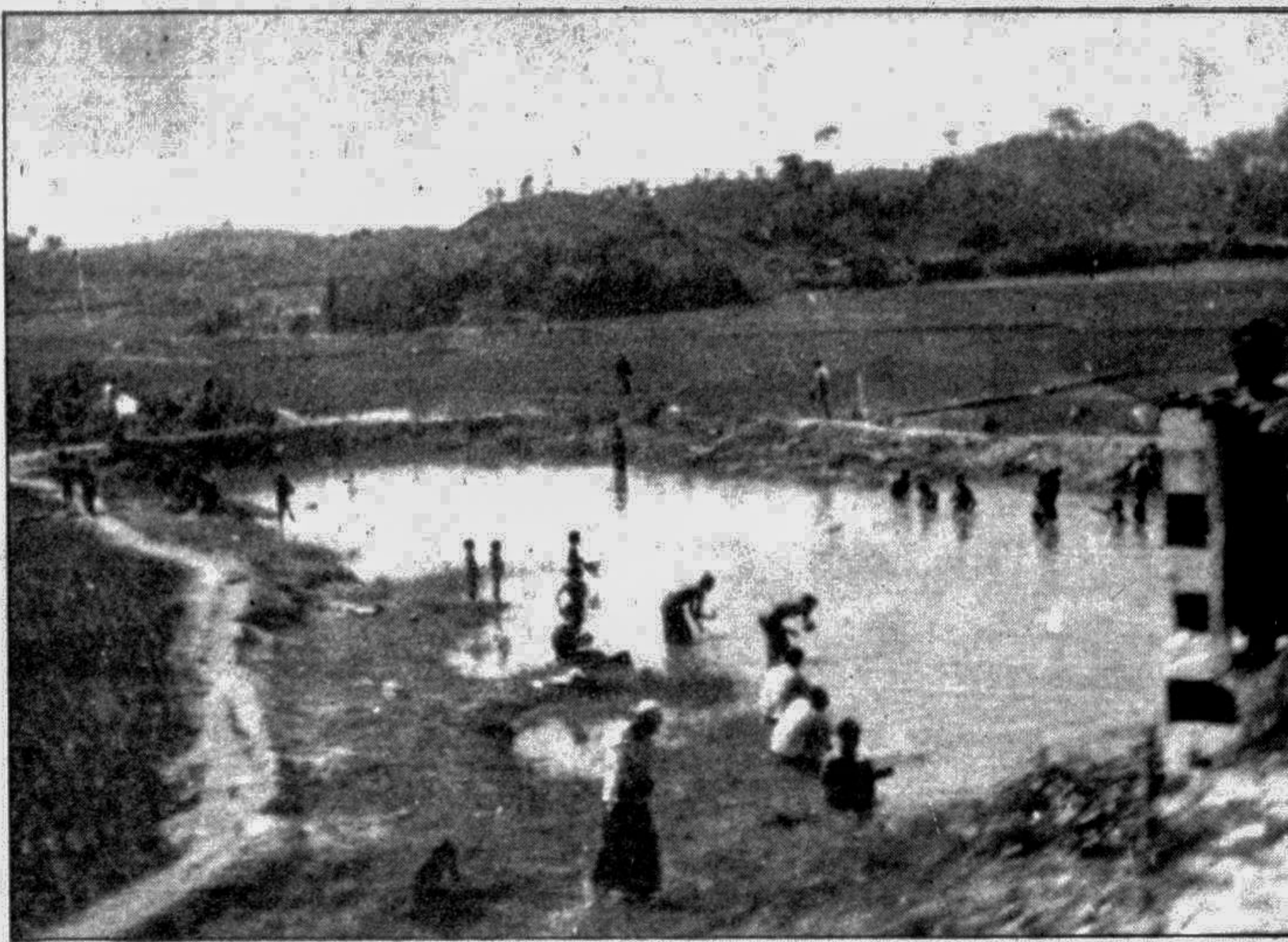
TEKNAF: Some Rohingya refugees are taking bath in knee deep water of a pond and are to drink the same for want of adequate supply.

Students grouping first, second and third will receive Taka 60, Taka 50, and Taka 40 respectively per month for one year.