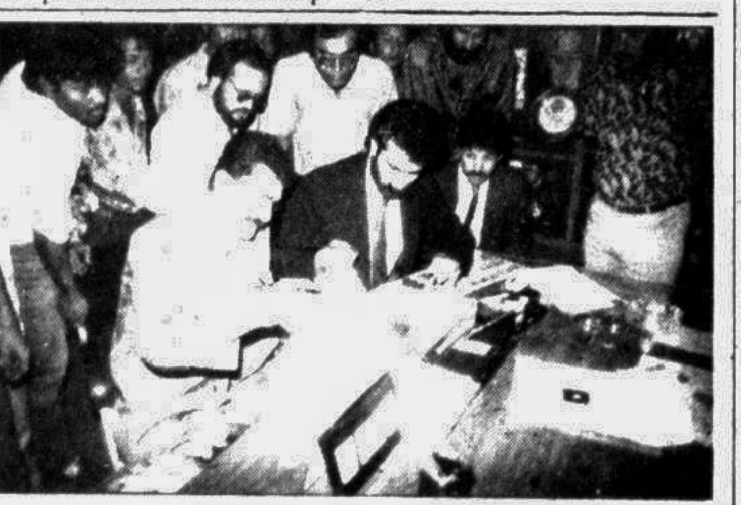
Brothers Union's Iraqi footballers seen completing their formalities at the DAMFA office yesterday.