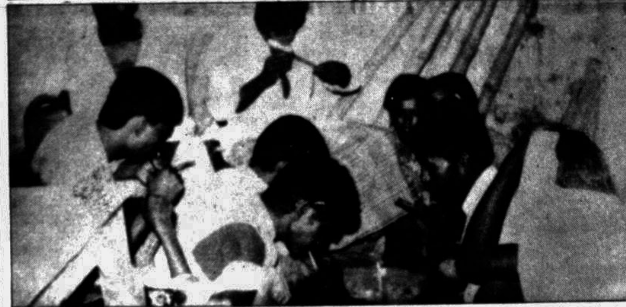
GAZIPUR: Some addicts are taking heroin in Tongi Pourashava area.

Alam Nagar Poultry Farm has earned a profit of Taka 23 lakh during the last year. According to a spokesman, the farm has earned this profit out of the sale proceeds of eggs, hen and ducks.