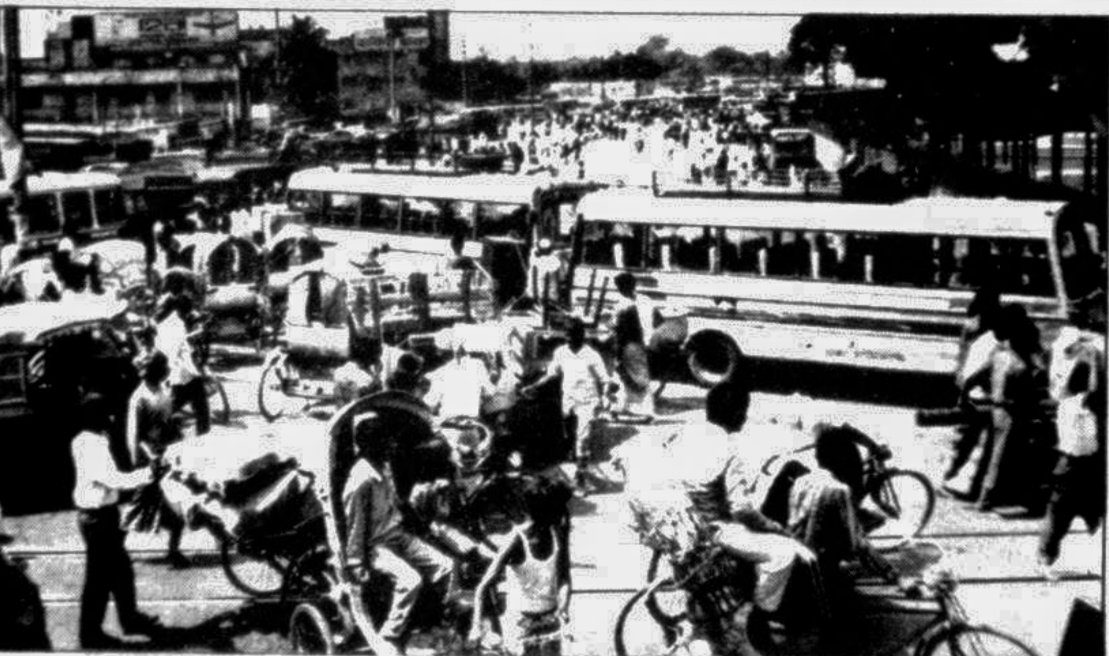
A group of bus drivers barricaded the road at Saidabad in the city yesterday following altercation with the traffic police.

The inaugural session was followed by an open discussion which was participated by a number of researchers and medical practitioners.