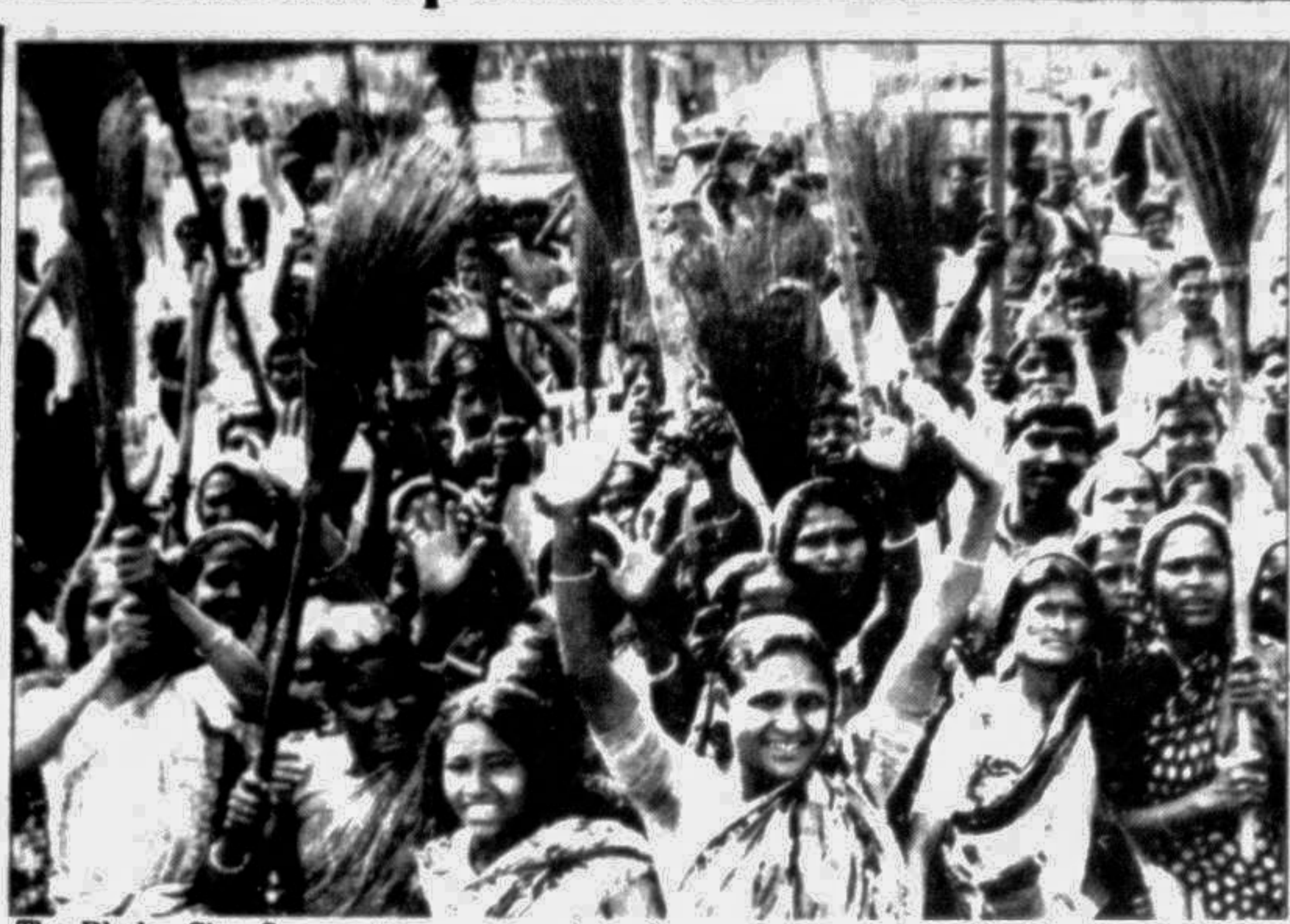
The Dhaka City Corporation sweepers brought out a procession at Gulshan in the city yesterday demanding pay scale.