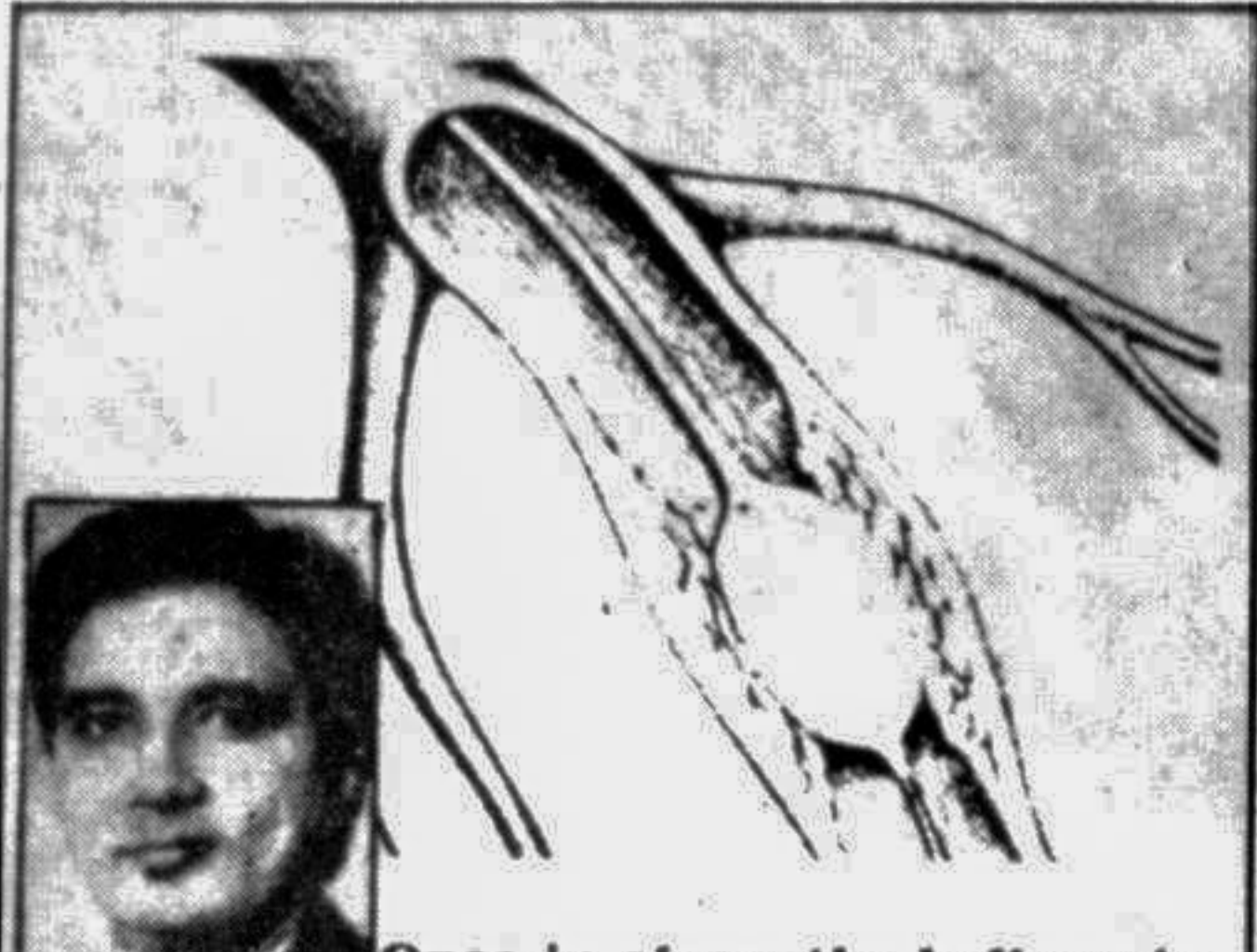
Once in place, the balloon is inflated to crack and compress the plaque, leaving a larger opening for blood to pass through.

During the last decade and a half, a procedure has been employed to open partially blocked coronary vessels of the heart before they become totally blocked. This procedure is called Percutaneous Transluminal Coronary Angioplasty (PTCA). A very small catheter,