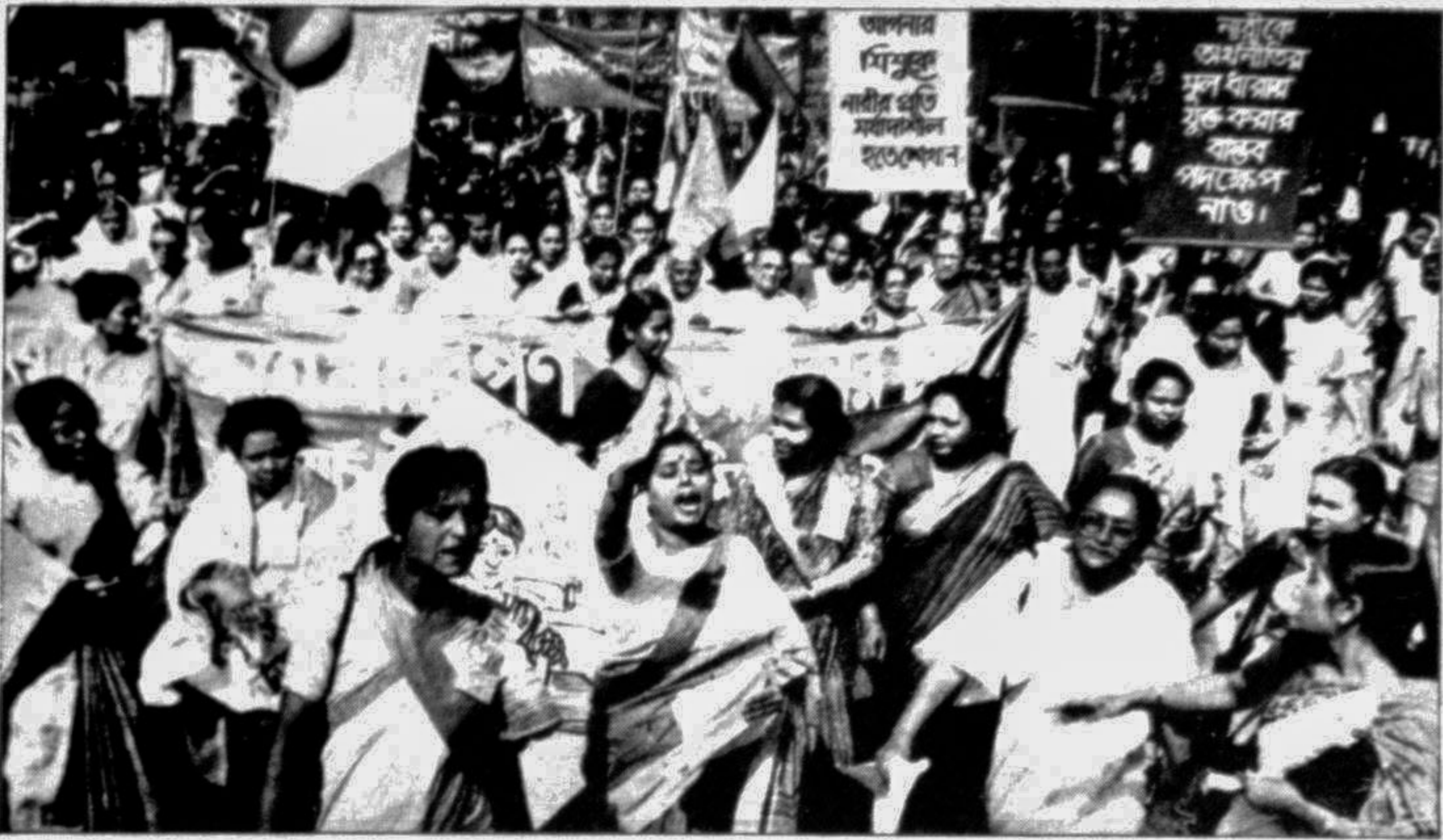
The Women's Day Observance Committee brought out a procession in the city yesterday to mark the International Women's Day.