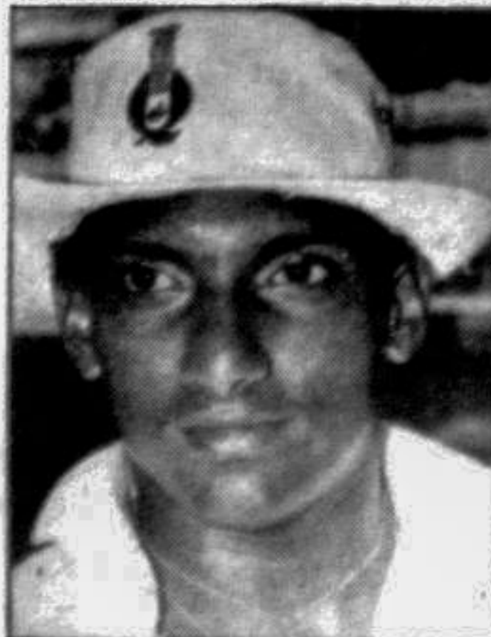
ARAVINDA DE SILVA