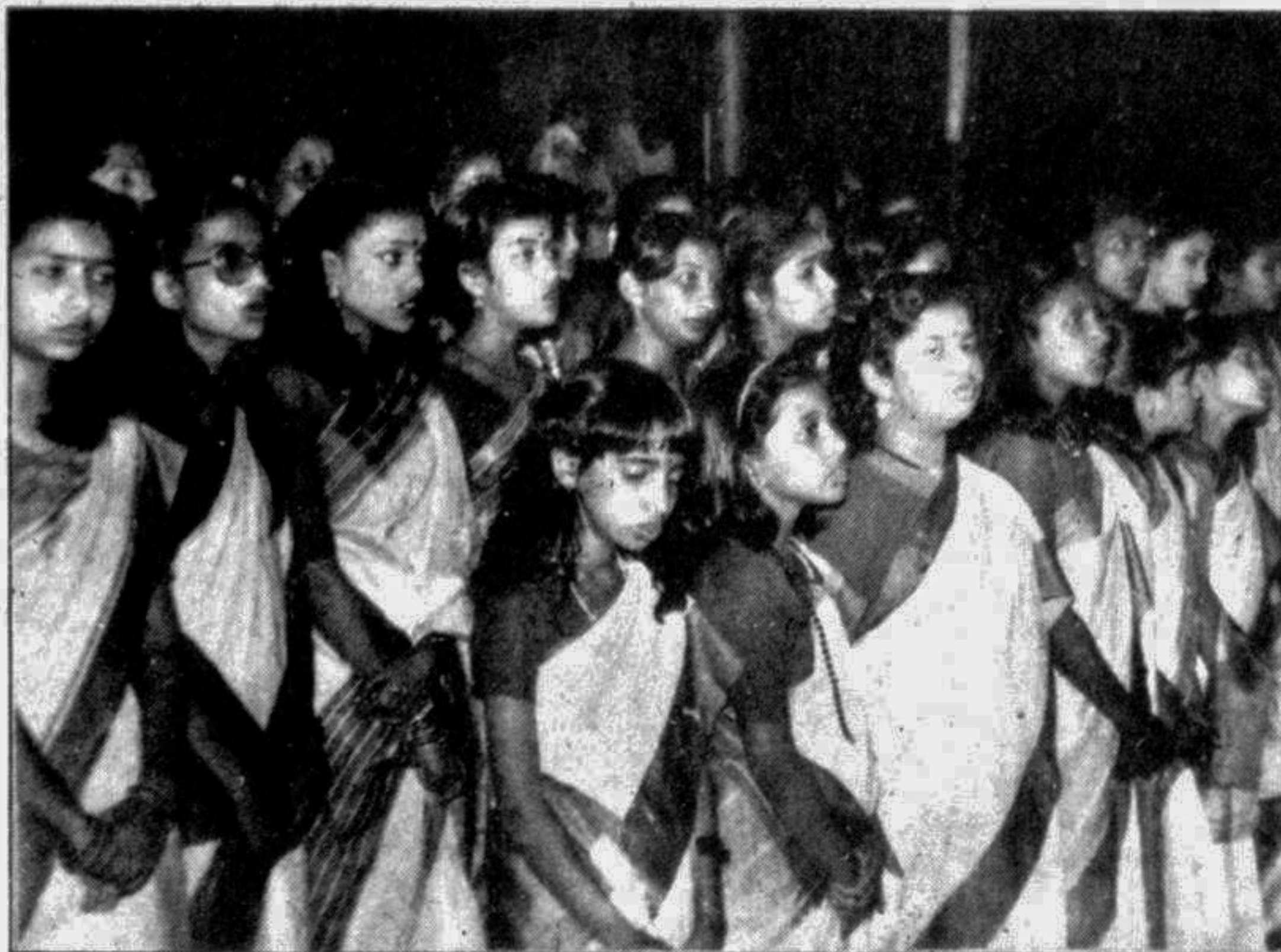
SYLHET: Artistes rendering songs at the inaugural session of the 3-day-long Jatiya Rabindra Sangeet Sammelon which began here on February 26 last.

It may mentioned that other godowns had been looted in the past in the same manner. The dacoits brought truck with them to carry the looted goods.