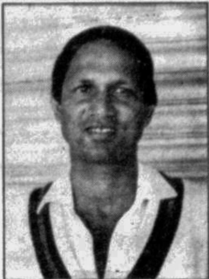
BIMANCHU... fine allround show

yesterday. It was a moment to cherish for last year's runners-up whose participation in the six-team super league was jeopardised by the desertion of