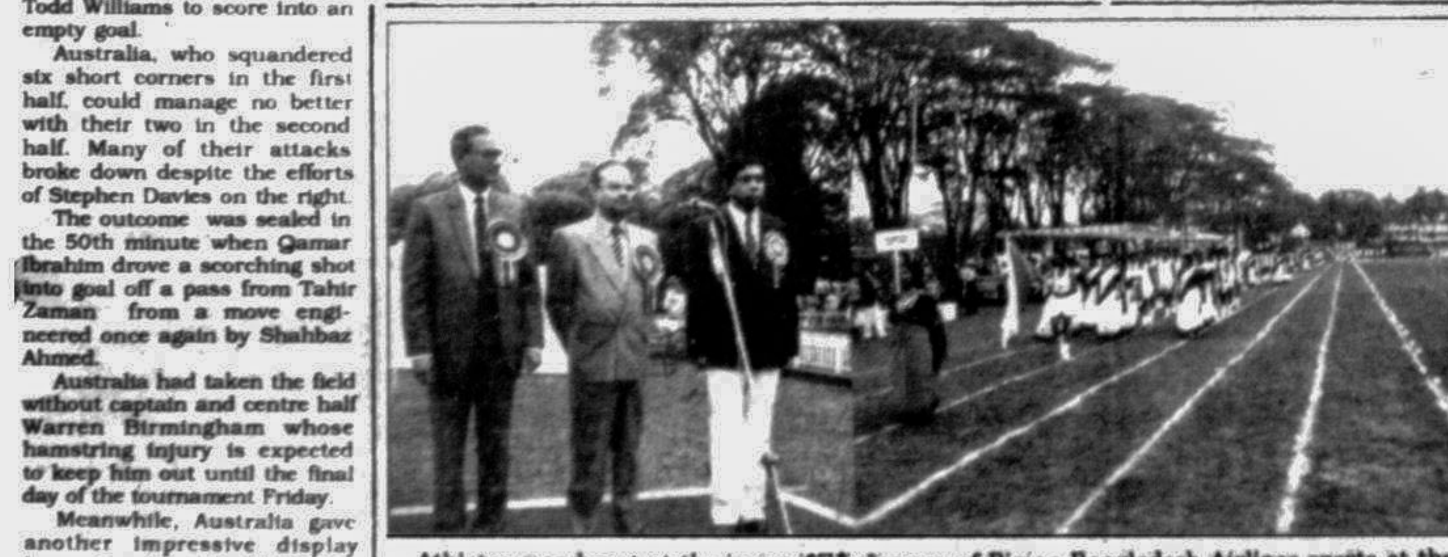
Athletes march past at the inaugural ceremony of Biman Bangladesh Airlines sports at the Rajbargh Police Line ground yesterday.