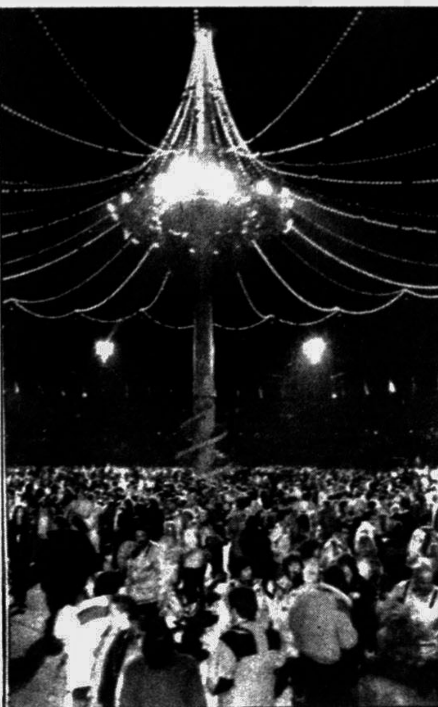
Crowd gathered to watch the closing ceremony of the 16th Winter Olympics dance polka at the end of the show in Albertville on Feb 23.

Tewksbury set a mark of 52.50 seconds Saturday night in the final race of the Canadian winter national swimming championships to eclipse the time of 52.52 he set Thursday at the same meeting.