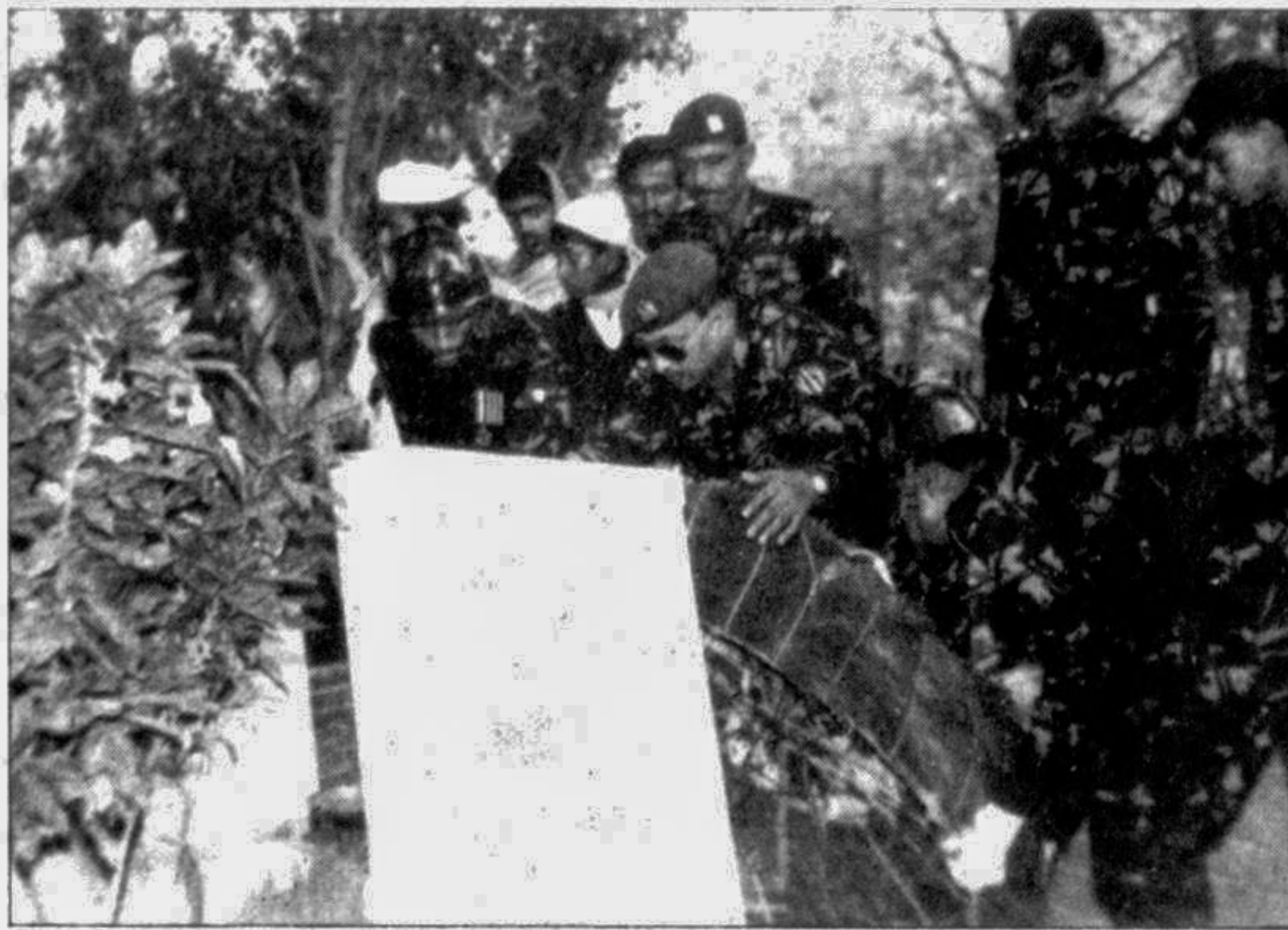
SYLHET: On behalf of the Chief of Bangladesh Army, the local army personnel are placing floral wreaths at the mazar of General MAG Osmany on the occasion of 8th death anniversary.

Later, the Minister visited the Nawabganj Degree College examination centre. He was informed that the administration was conducting the examination peacefully.