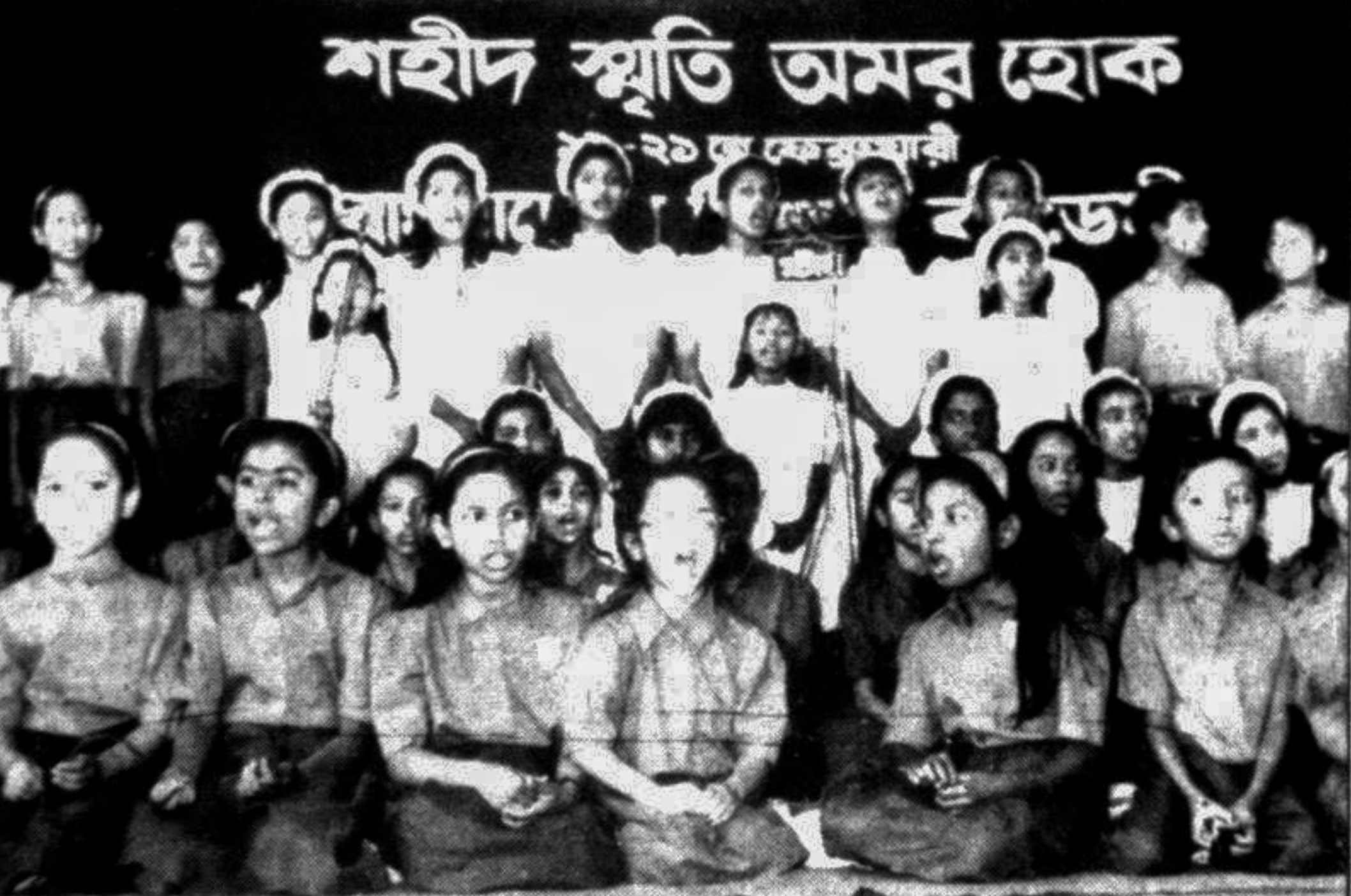
Child artistes rending patriotic songs Thursday at a cultural function at Shishu Academy auditorium in observance of Ekushey