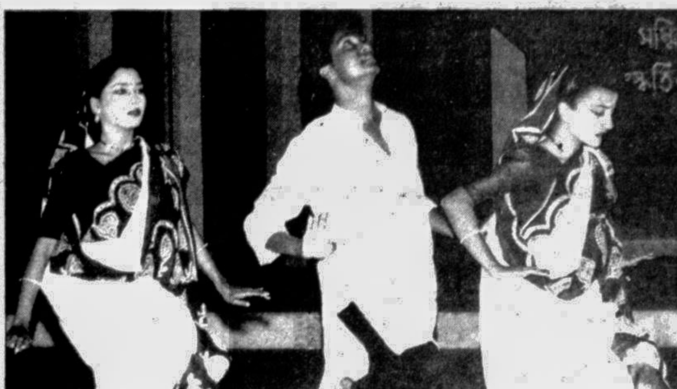
A sequence of a dance drama jointly organised by Sammito Sangskritik Jote (Combined Cultural Alliance) and Shilpakala Academy at the Central Shaheed Minar Monday on the occasion of Ekushey.