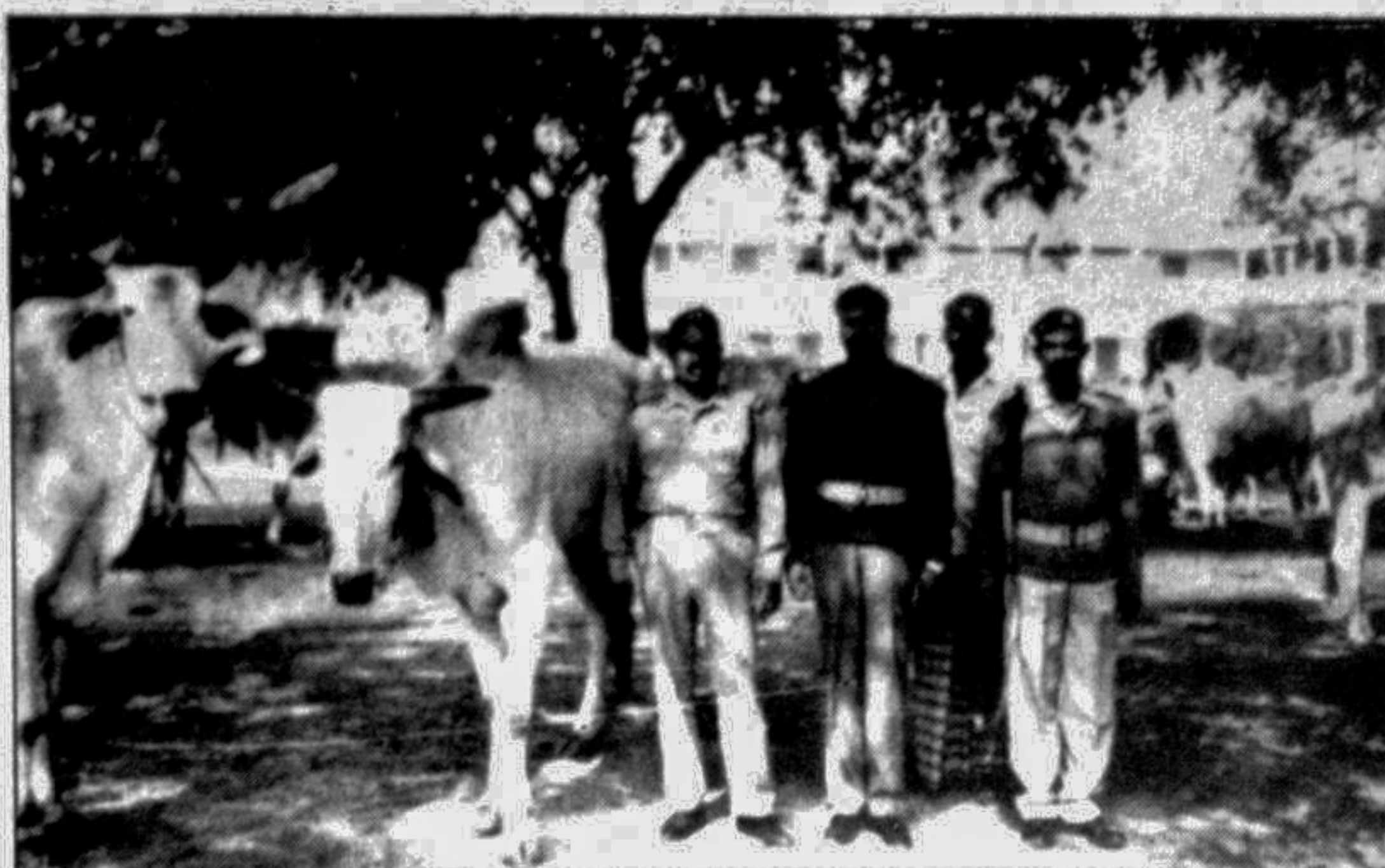
JHENIDAH: Police seized 24 Indian cows on Thursday at Tetultala under sadar upazila.

Lack of traffic knowledge of the rickshawpullers has worsened the already precarious situation.