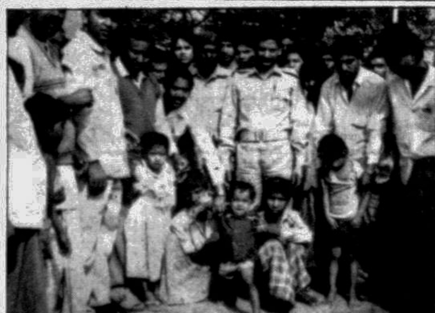
GAZIPUR: The local people caught two child-lifters with three children near Rice Research Institute, Joydevpur recently and later handed over to Joydevpur police.

Local people urged the authorities to take necessary action against the burning of woods in the brickfields and protect the nature from ecological imbalance.