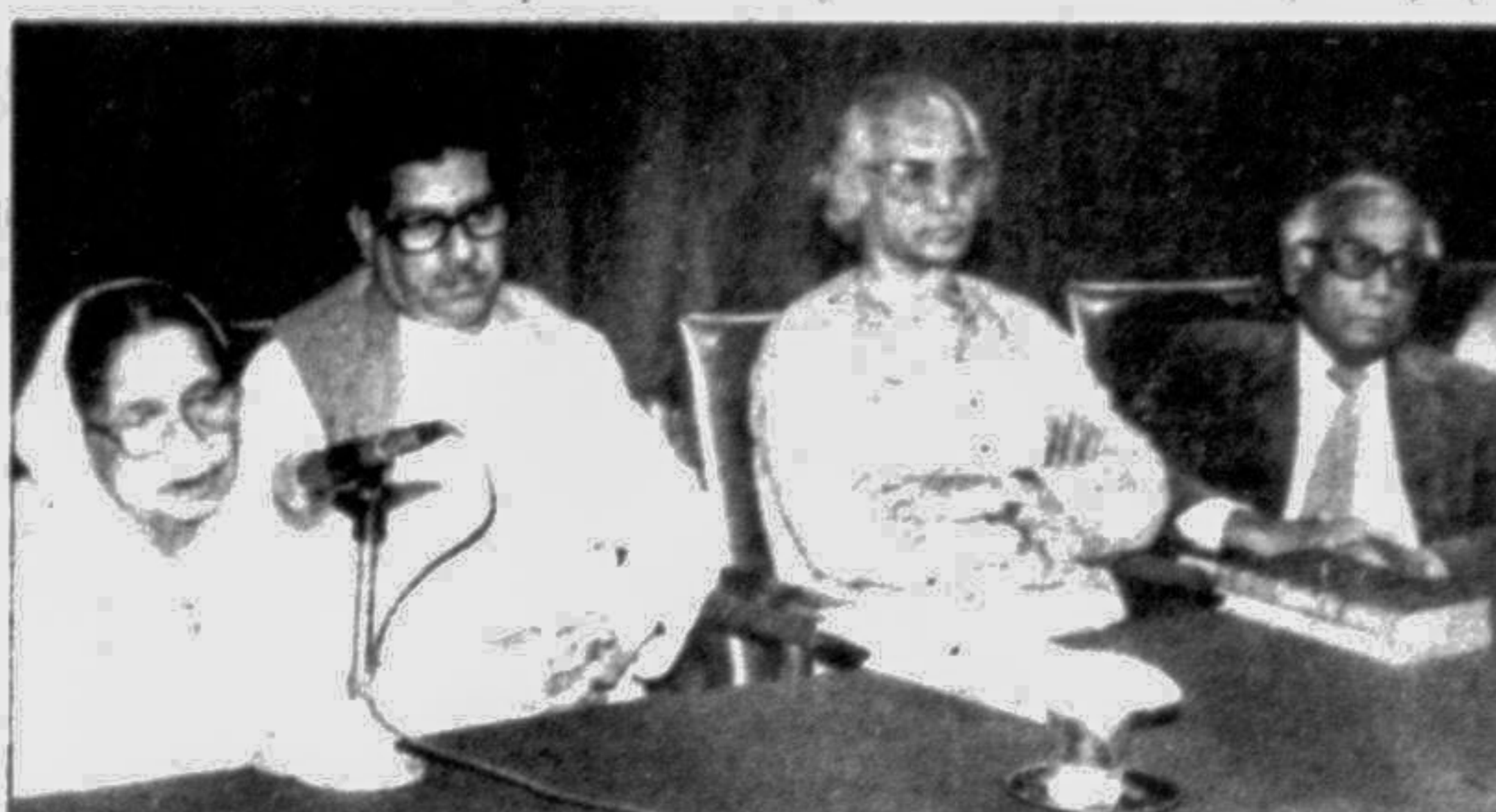
Begum Sufia Kamal speaking as the chief guest at the publication ceremony of two books at the National Museum Auditorium in the city yesterday.