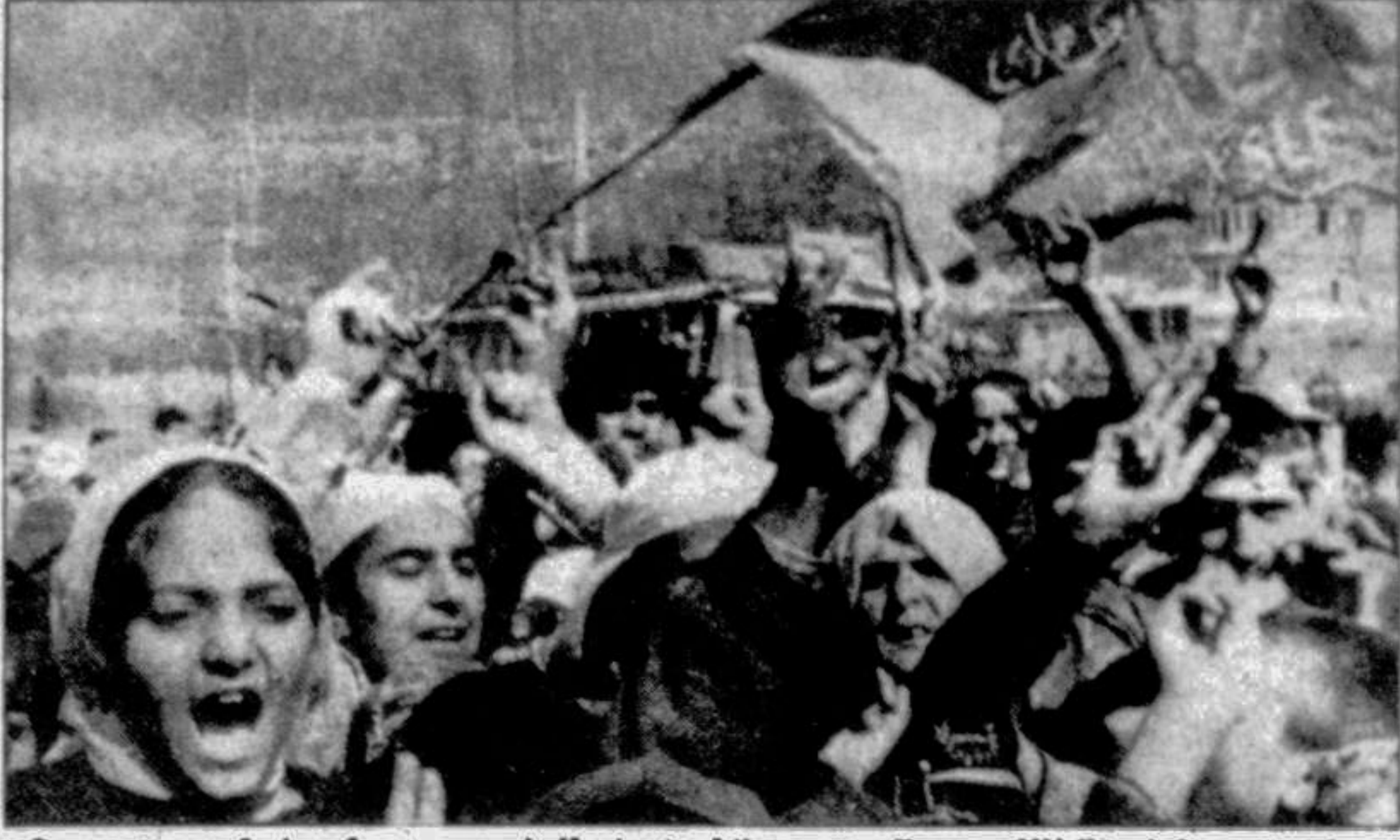
Supporters of the Jammu and Kashmir Liberation Front (JKLF), defying curfew, demonstrating Tuesday in northern Kashmir

CHINARI (Pakistan), Feb 12: Pakistan security forces arrested a Kashmiri militant leader and 100 of his diehard supporters after up to 12 people were killed in clashes while trying to march to the border with India today, reports Reuters.