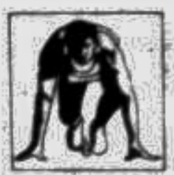
NEW YORK, Feb 8: Andre Cason, fresh from his world-record performance last week, clocked 6.52 seconds to beat fellow American Leroy Burrell over 60 metres at the 85th Millrose Games indoor athletics meeting at Madison Square Garden on Friday, reports Reuter.