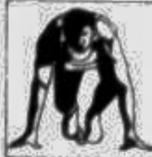
KATRIN KRABBE...widespread suspicions