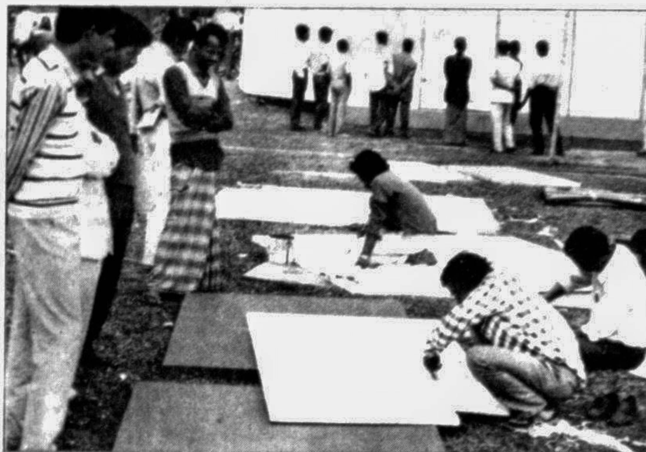
Final touches to the preparations Thursday as the Ekushe Book Fair begins in the Bangla Academy premises today (Friday).