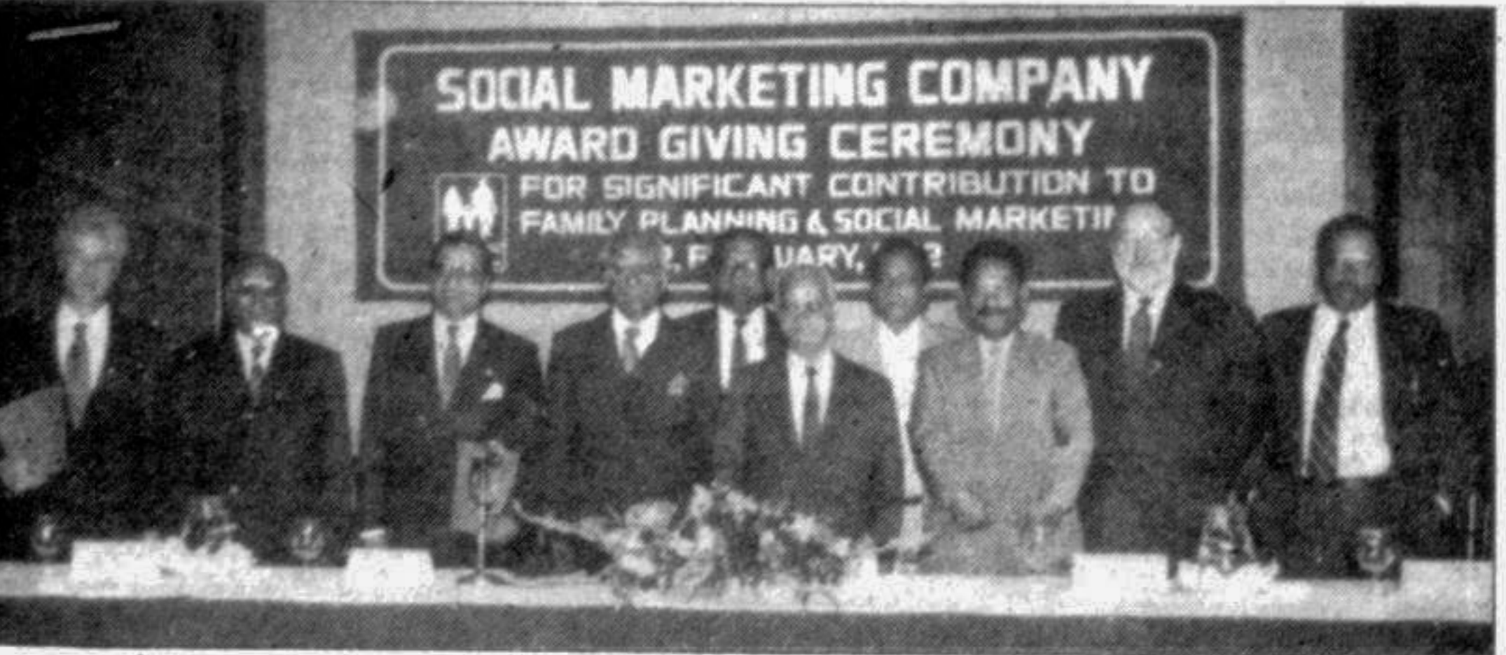
President Abdur Rahman Biswas is seen with recipients of award for significant contribution to Family Planning and Social Marketing at the award giving ceremony of the Social Marketing Company held at a local hotel on Sunday. Seen in the photo (from left to right) are: W R Goldman, USAID; M Mokammel Haque, MOHFW; Alamgir M A Kabir, FPAB; M Chowdhury, SMC; Nazmul Huq, DGFP and RL Ciszewski, PSI.