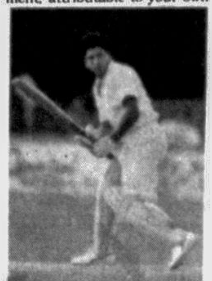
S TENDULKAR... 114 talents and skills. "Your determination to strive for excellence has been rewarded. Well done. Go for 432."

It said: "Congratulations on achieving 400-Test wickets. This is a magnificent achievement, attributable to your own