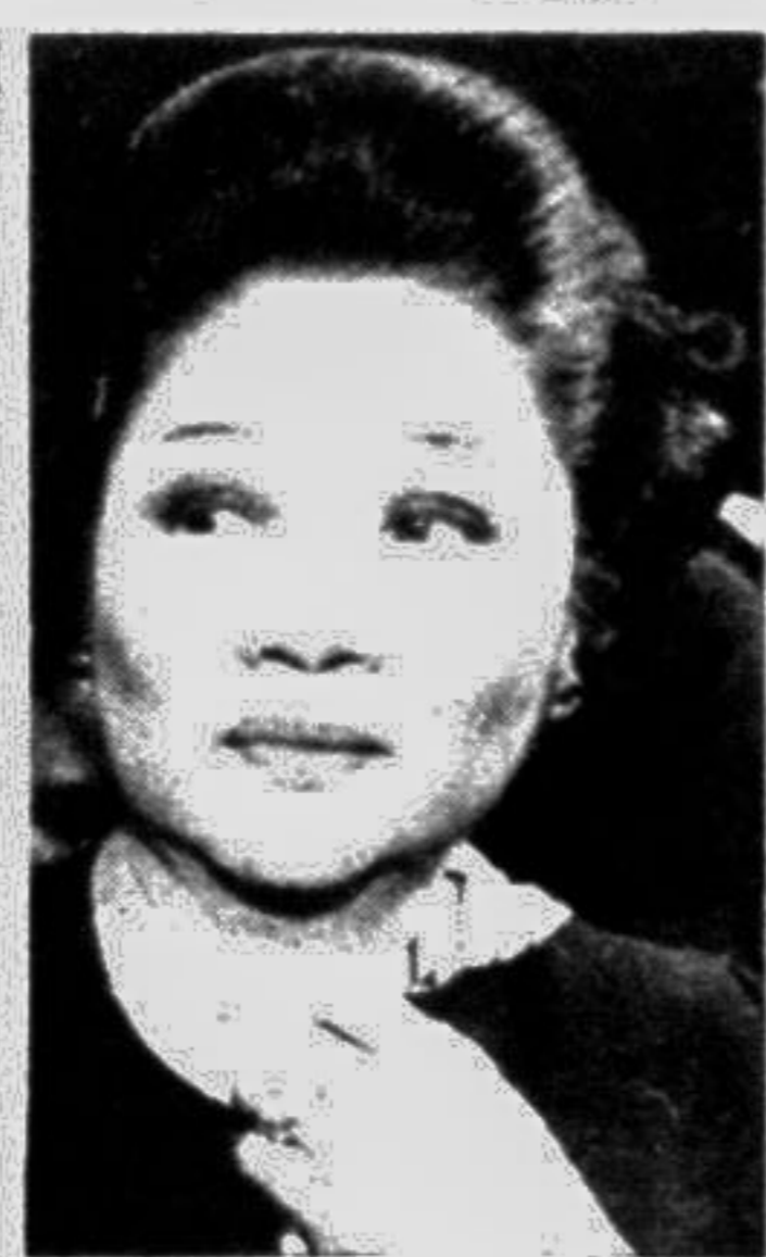
Imelda unveils 'secret' of her fortune

Vajpayee said that the Congress(I) should evolve a consensus of different political parties on the areas where a major thrust should be given in the budget. If the Congress (I) is keen to remain in power, it will have to take this into account, the BJP leader said.