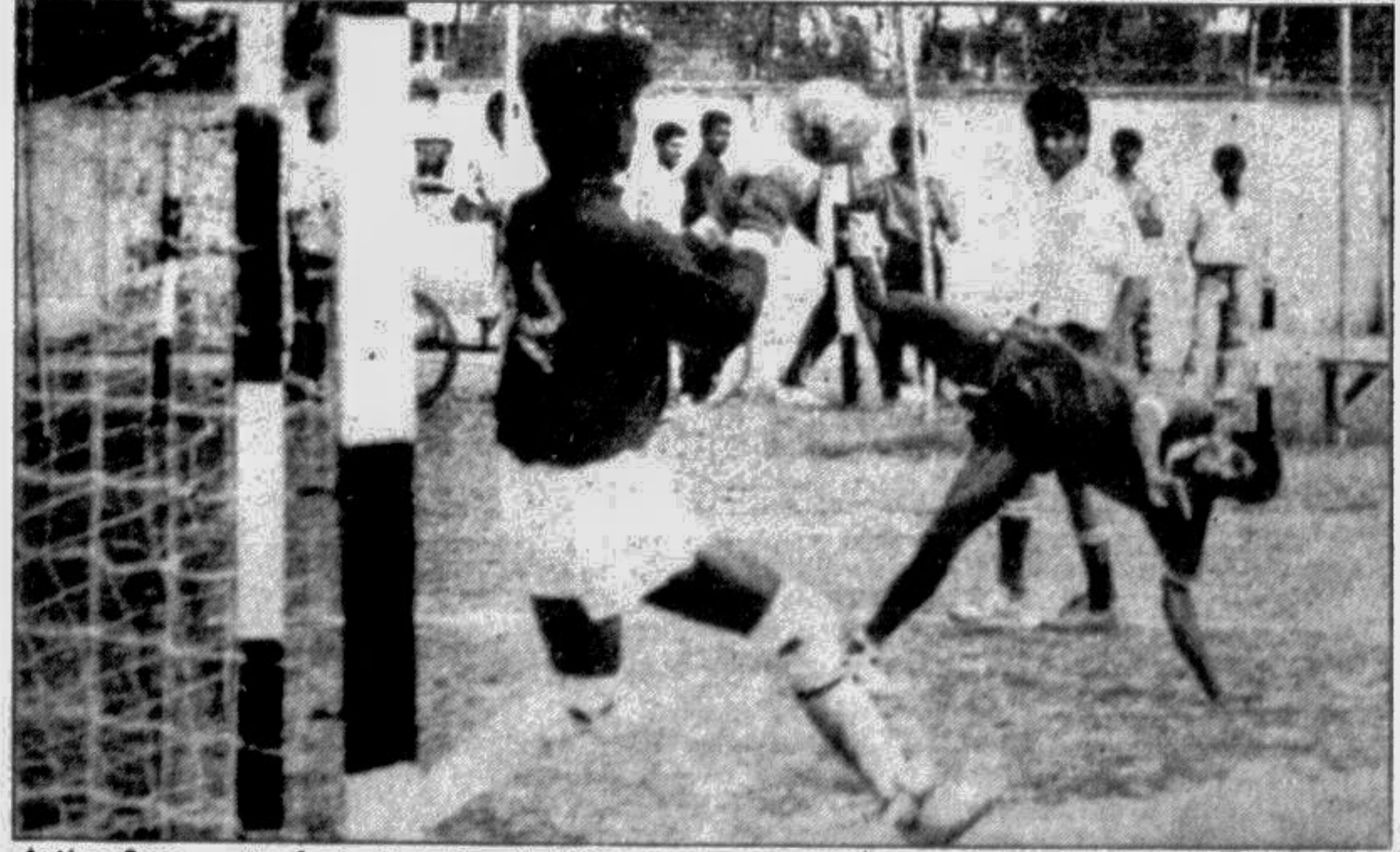
Action from yesterday's Cute handball league encounter between Police and Tarun Sangsad at the Outer Stadium.