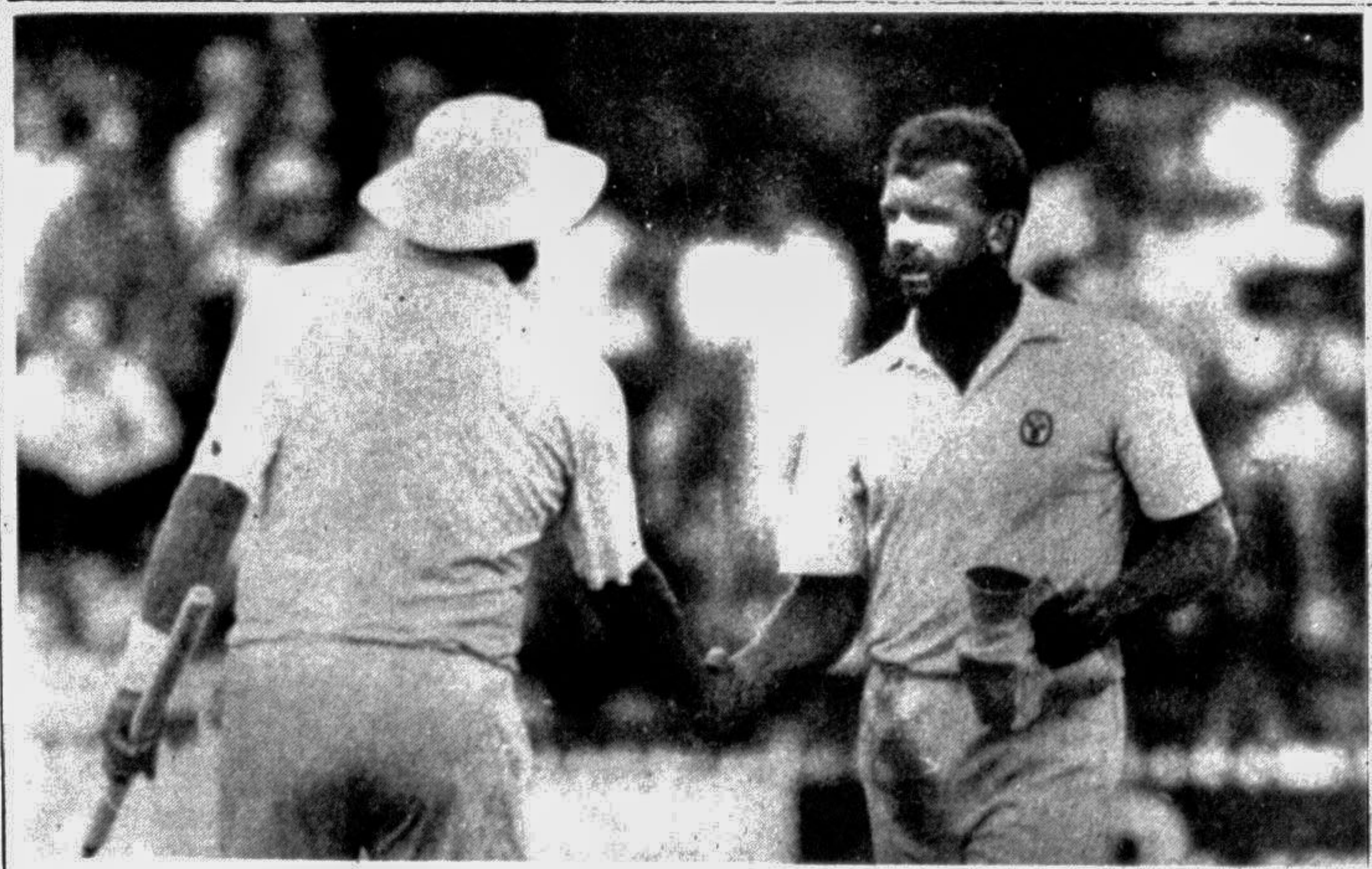
Australian opening bowler Craig McDermott is congratulated by fellow Australian bowler Merv Hughes after his five-wicket haul in the second innings of the fourth Test against India in Adelaide yesterday. McDermott took 10 wickets for the game that saw Australia win by 38 runs and take a 3-0 lead in the five-Test series.

"This is the first hurdle that has been caused outside cricket. It wasn't completely unexpected, I can tell you, it's the way of the world."