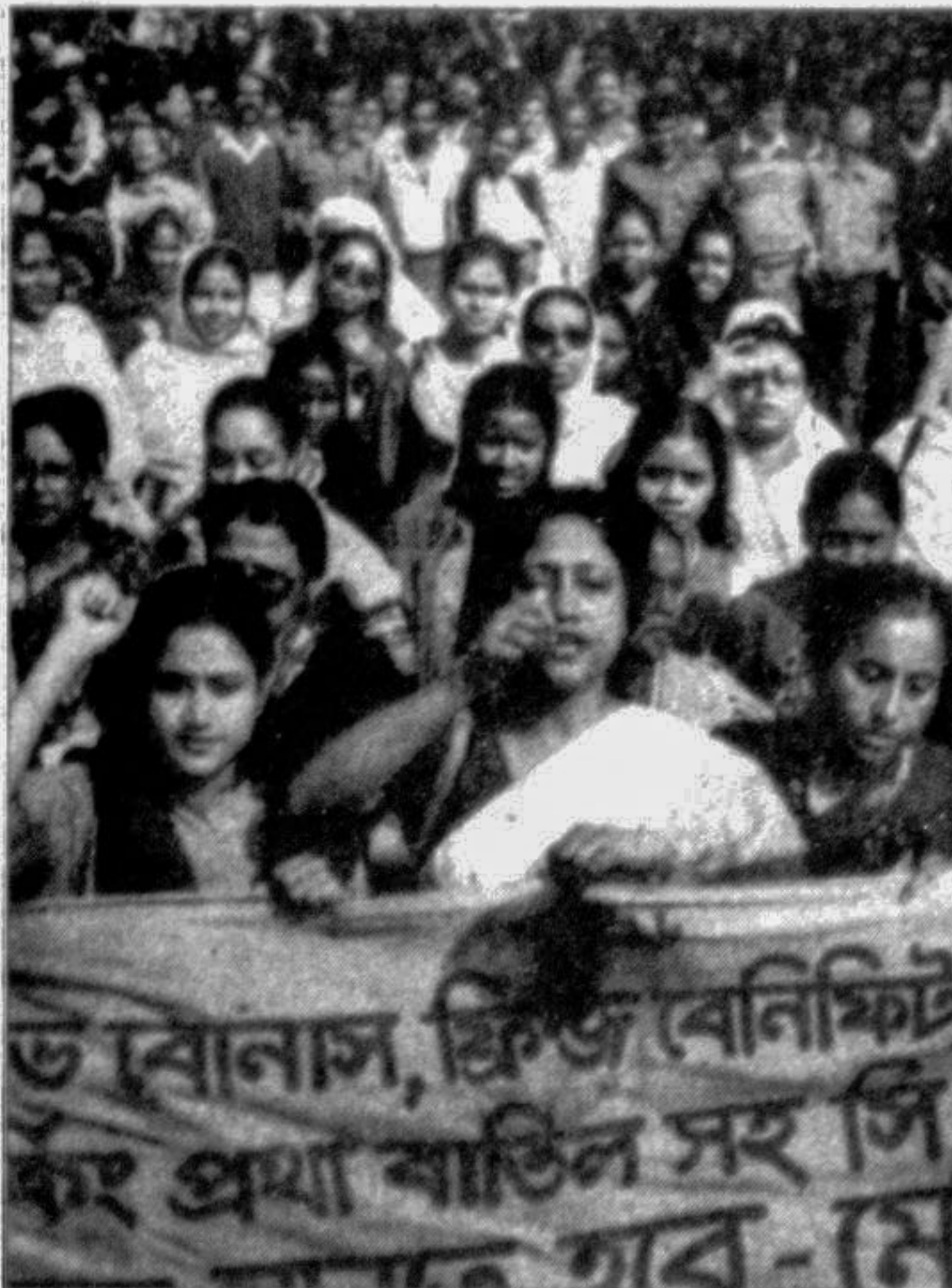
Sonali Bank officers and employees demonstrating in the city yesterday demanding implementation of Wage Commission.

He stayed with the Prime Minister sometime and discussed matters of mutual interest.