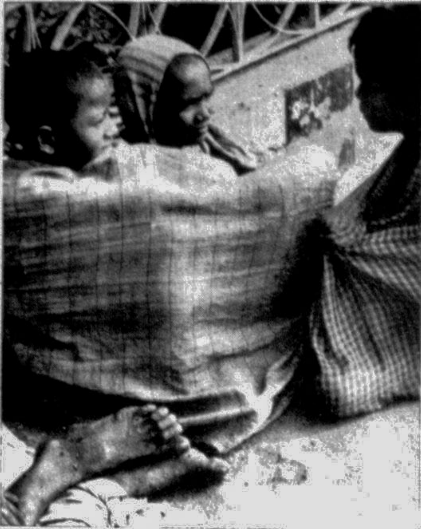
A life of extreme tolerance

As human being we do not stand in any position to question the ways of God, but it certainly disturbs one's conscience to face the poignant reality that there is so much difference between man and man under the sun.