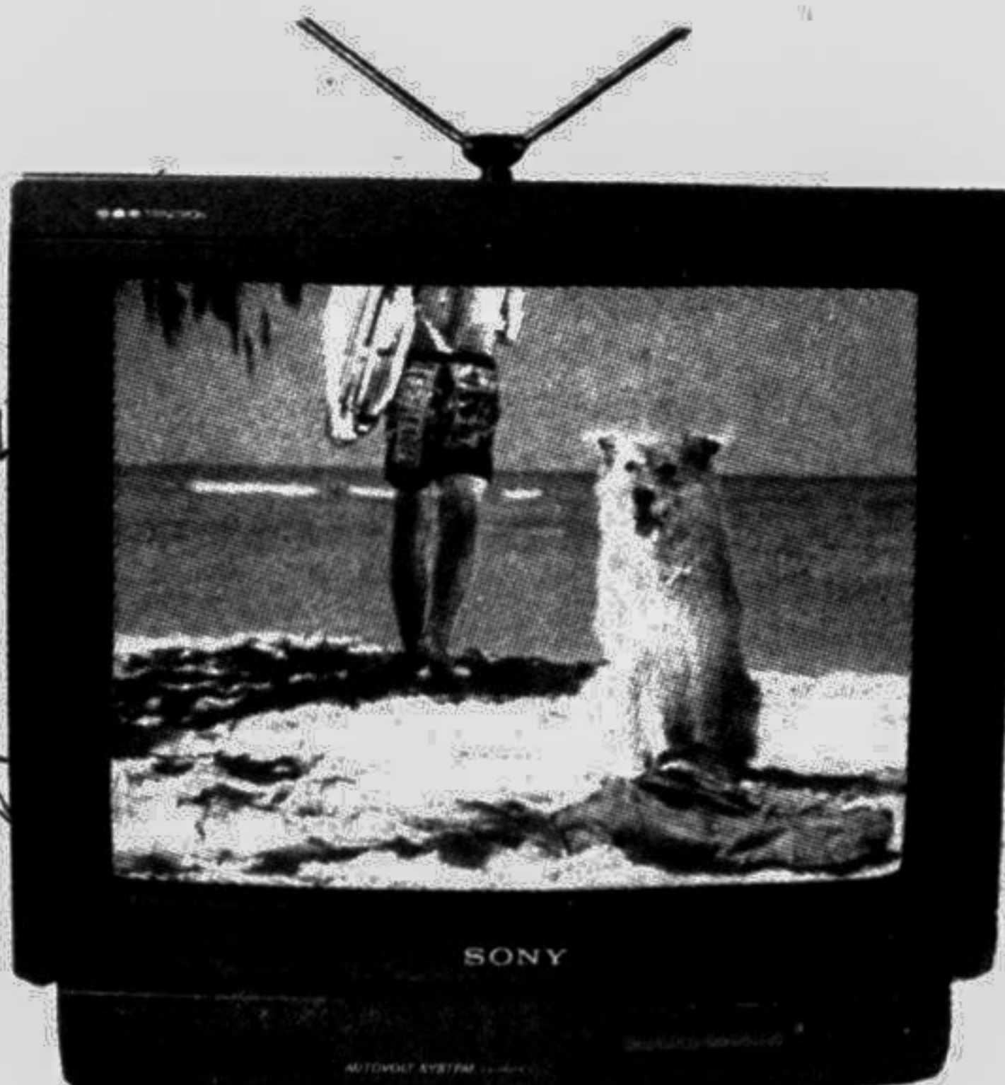
Model KV 2102 GE (21)

Due to its high demand you could not get SONY Colour Television for some time. We are sorry for the inconvenience. Now you can get your set today from our dealers.