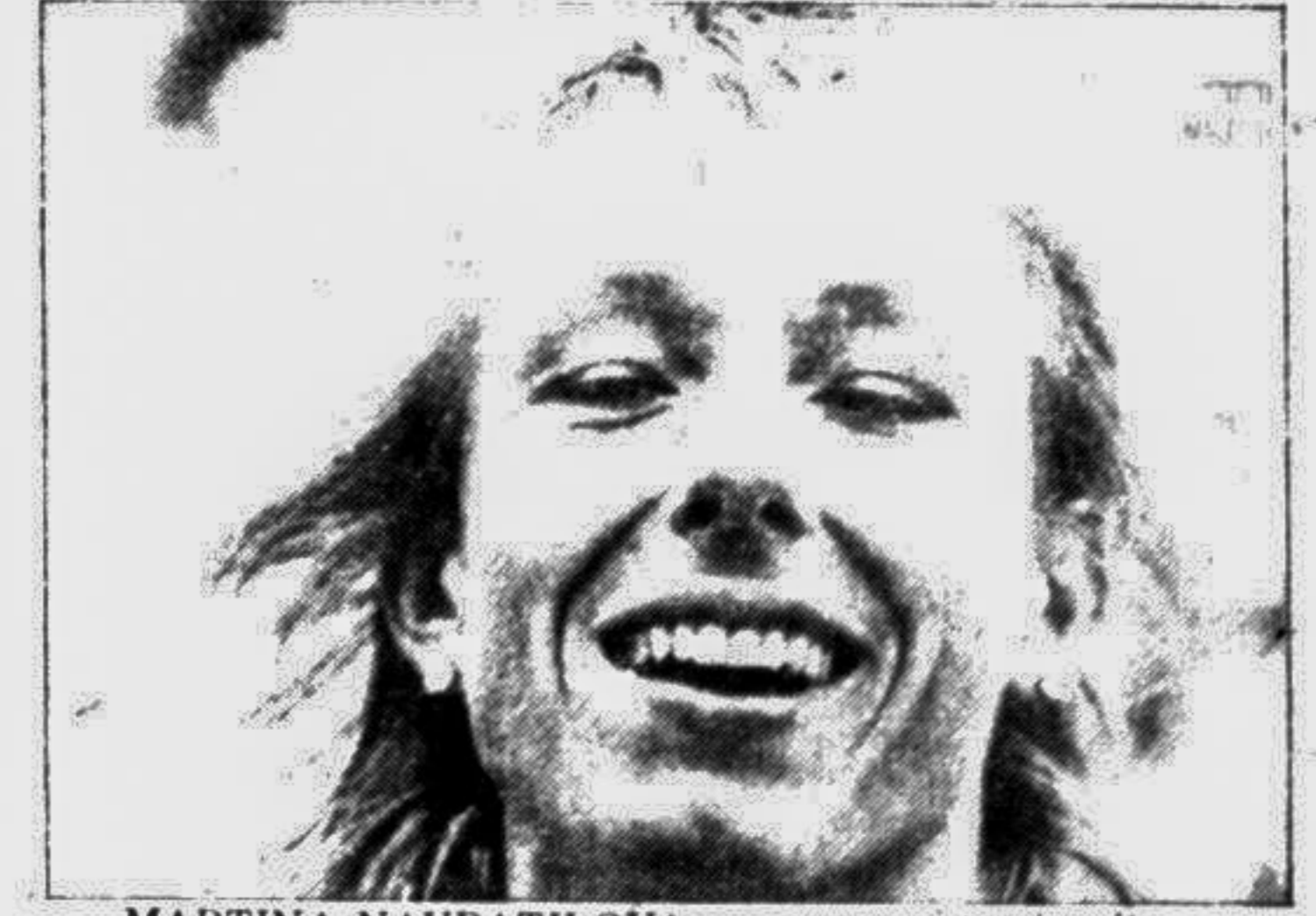
MARTINA NAVRATILOVA returns to circuit Sukova of Czechoslovakia and Arantxa Sanchez Vicario of Spain.

Navratilova, the winner here in 1989 and runner-up last year, faces a sea of tough opposition from Gabriela Sabatini of Argentina, Americans Jennifer Capriati and Lori McNeil, Helena