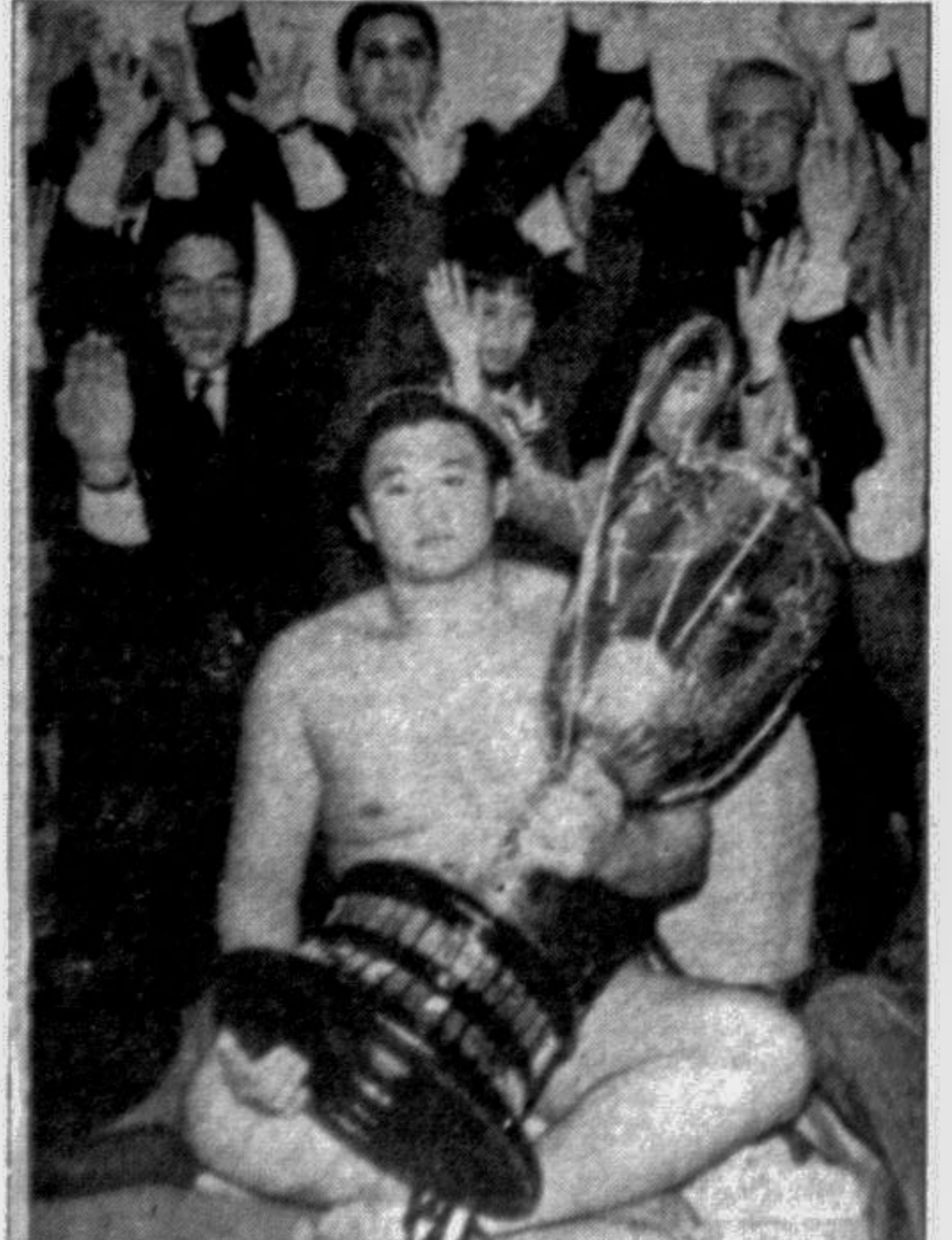
Takahanada, 19, became the first teenager in history to win the 15-day grand sumo tournament in Tokyo on January 26.

Takahanada's victory celebrations were a family affair. The teenager received the winner's cup from his uncle, Futagoyama, himself a former grand champion and the retiring head of the sumo association.