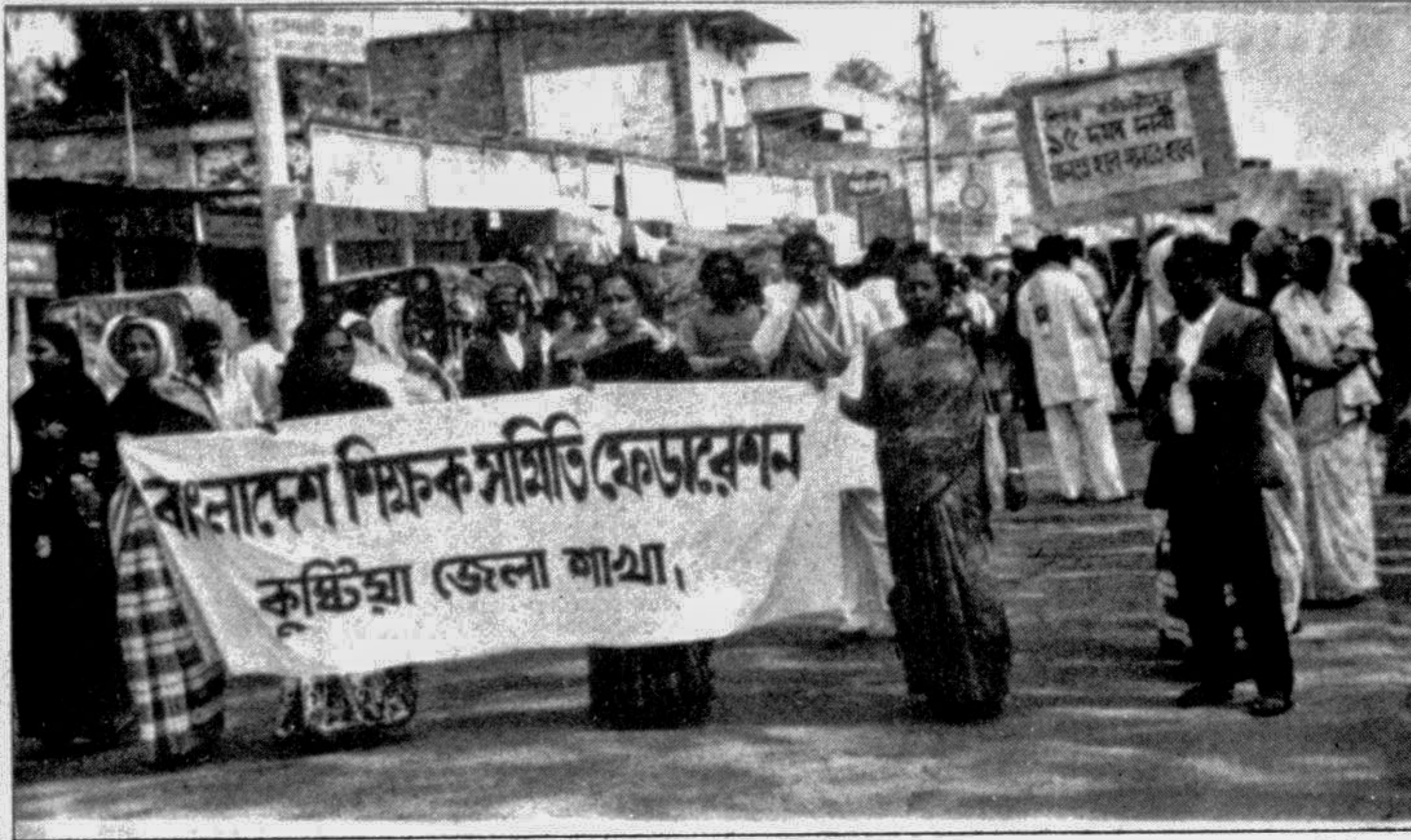
KUSHTIA: The teachers of Bangladesh Sikkhak Samity Federation, local unit brought out a procession in support of their demands recently. The teachers are still now on strike.

Jan 27: The Forest Department recently filed a case against eight persons including a former Chairman of Ghatal Upazila Parishad on charge of encroachment into forest area and destroying the valuable forest resources worth several lakh taka in Sandhanpur Union, reports BSS. Police said six persons have been arrested in this connection.