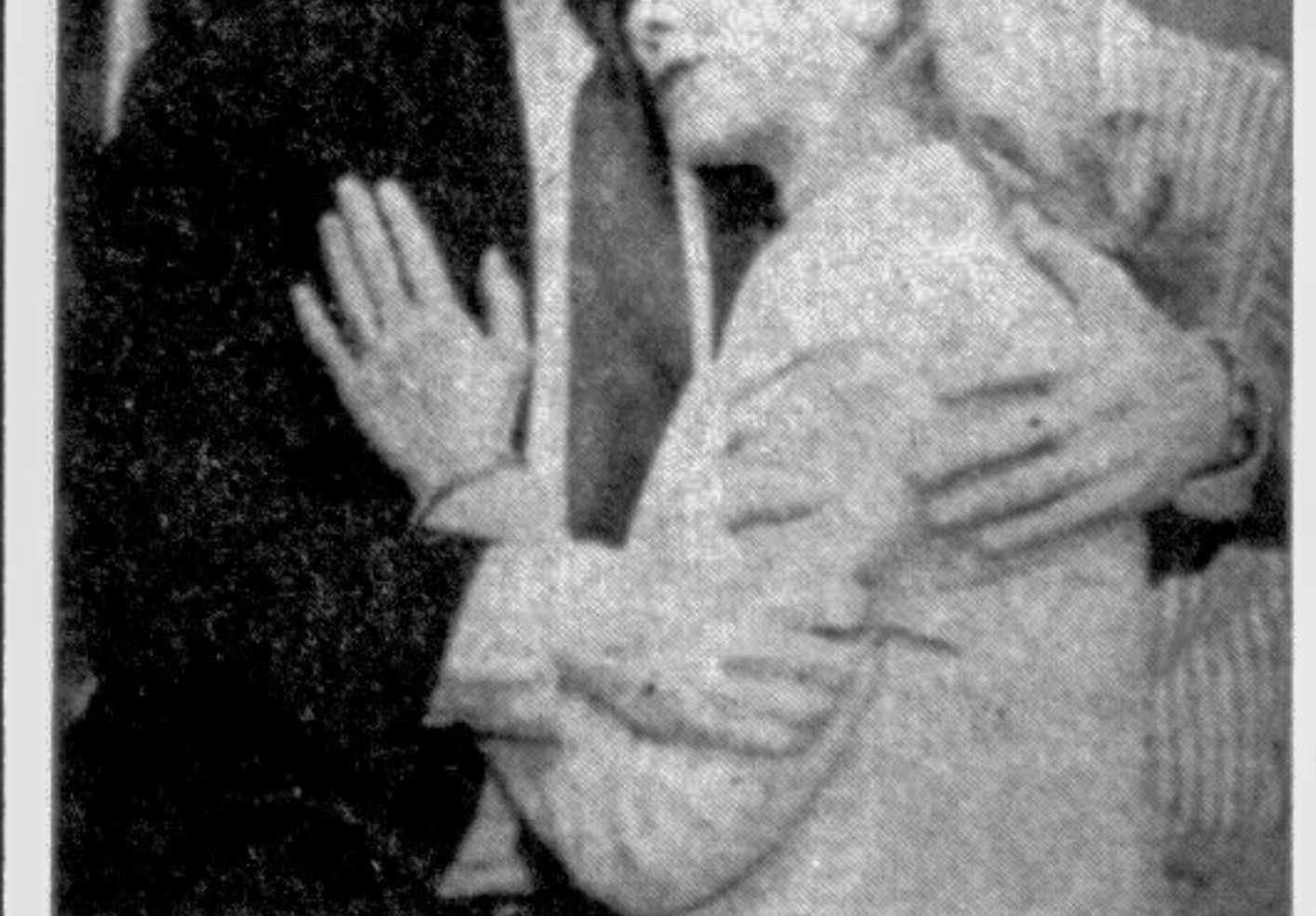
BOSTON, Arkansas government and Democratic Presidential hopeful Bill Clinton embraces his wife Hillary after some lighting fell near them during the taping of CBS's '60 Minutes' interview.

But last year he hotly denied rumours that he had undergone cosmetic surgery, blaming his suddenly swollen features on a sways sting.