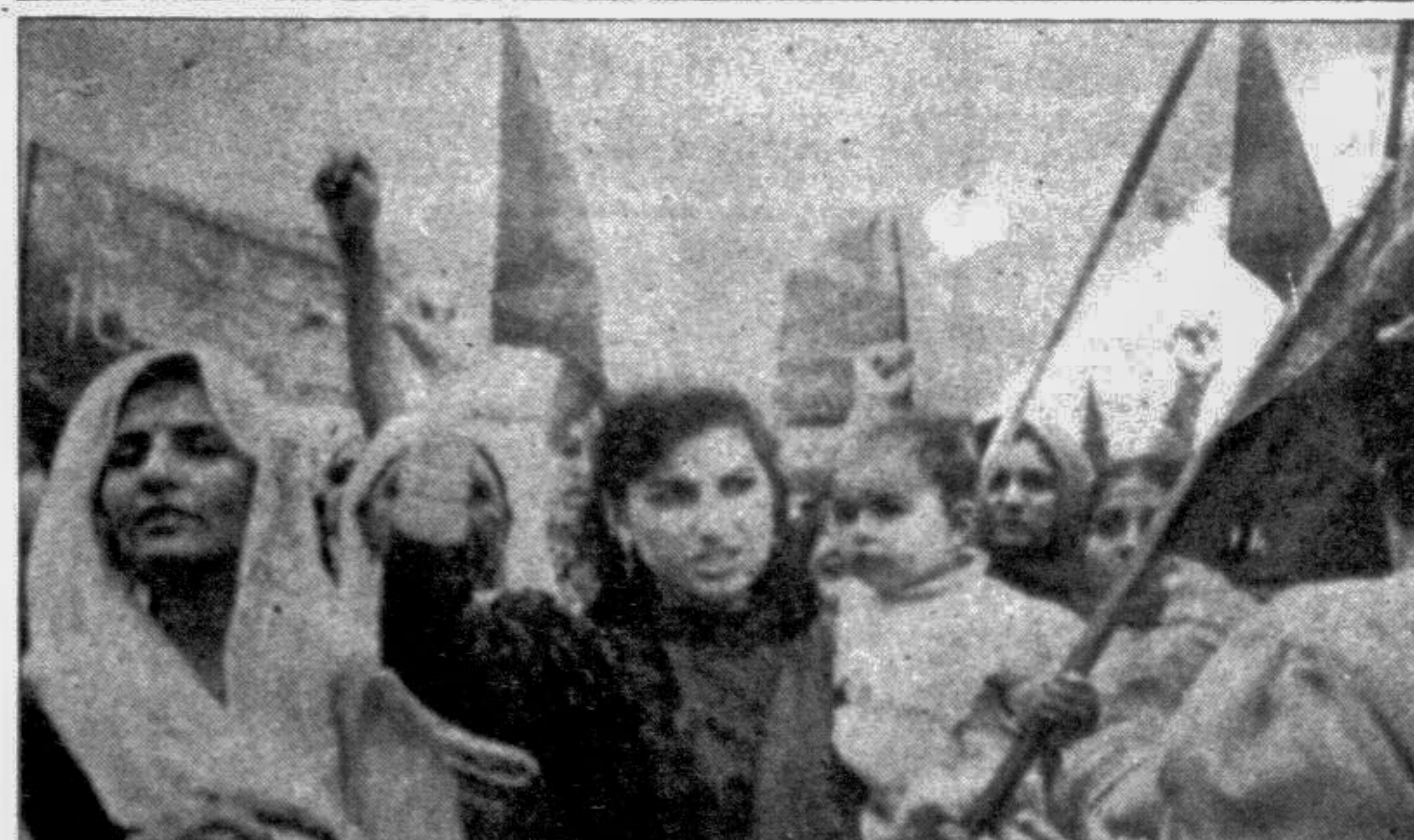
KARACHI: Kashmiri women protest against the unfurling of the Indian national flag in Indian-held Kashmir by the leader of the Hindu fundamentalist Bharatiya Janata Party (BJP). Muslim separatists are waging a campaign for secession in Indian-held Kashmir.

The PLO has argued it was entitled to take part in the Moscow conference because the multilateral talks would also cover the issue of Palestinian refugees, a prime concern of the organisation.