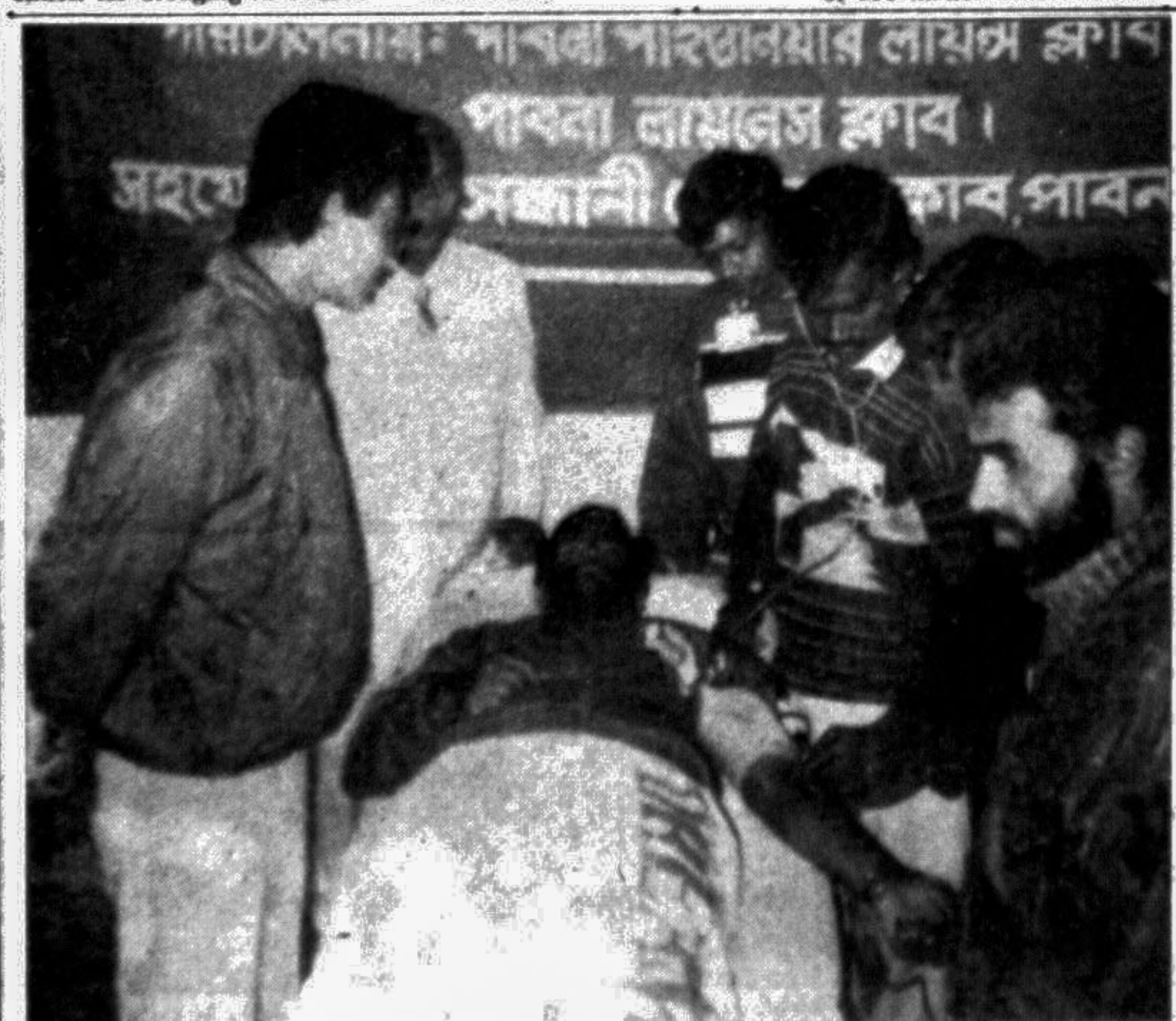
PABNA: Local Lions Club arranged a blood-donation programme in observance of 75th founding anniversary of International Lions Club recently.