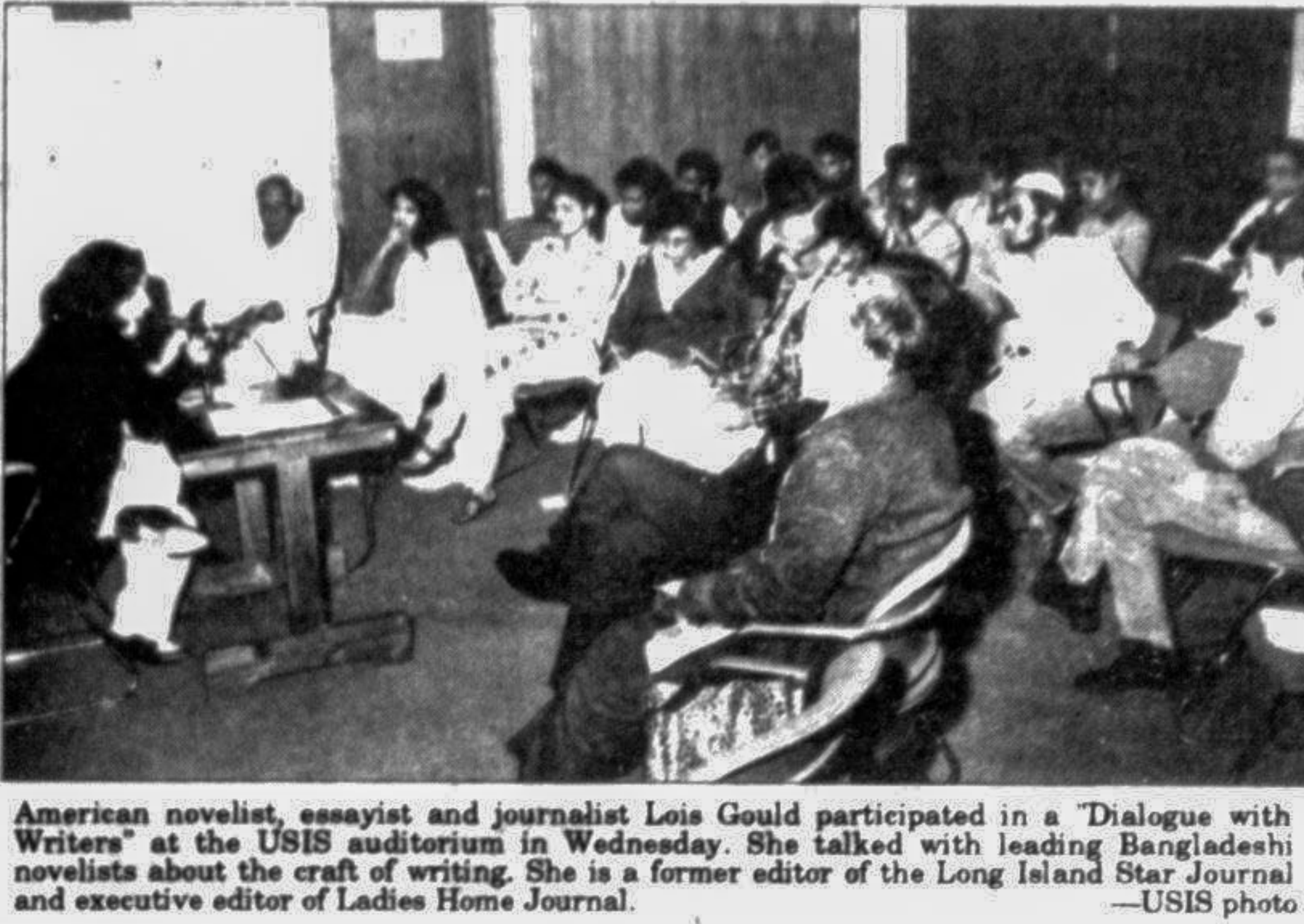
American novelist, essayist and journalist Lois Gould participated in a 'Dialogue with Writers' at the USIS auditorium in Wednesday. She talked with leading Bangladeshi novelists about the craft of writing. She is a former editor of the Long Island Star Journal and executive editor of Ladies Home Journal.