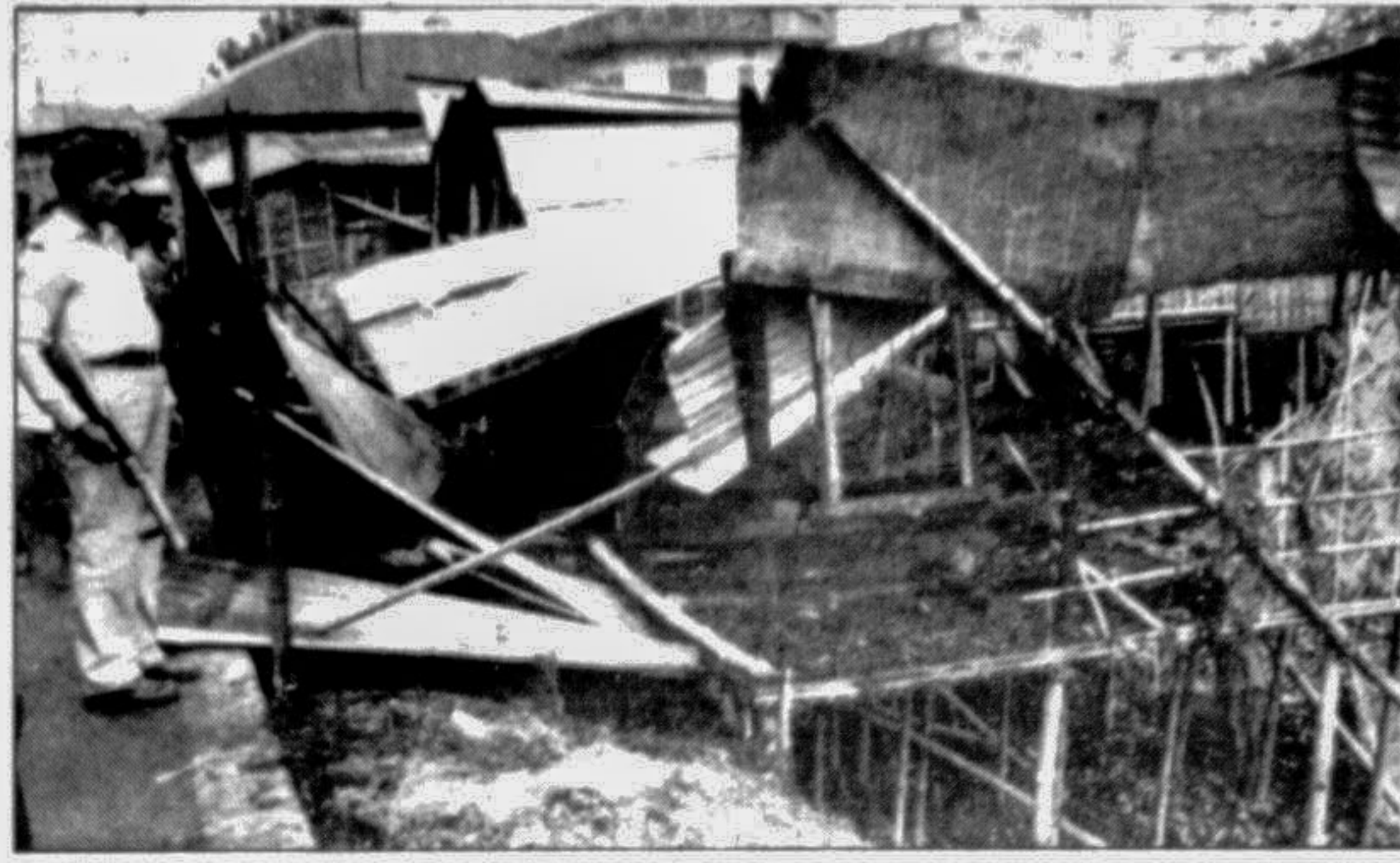
A group of youths damaged and set ablaze the RND Samaj Kalyan Sangha and Library at Rajendhar Road under Lalbag PS. It was a sequel to local feud over toll collection.

The Commerce Ministry said survival in competitive market in the context of free market economy depended on quality of goods.