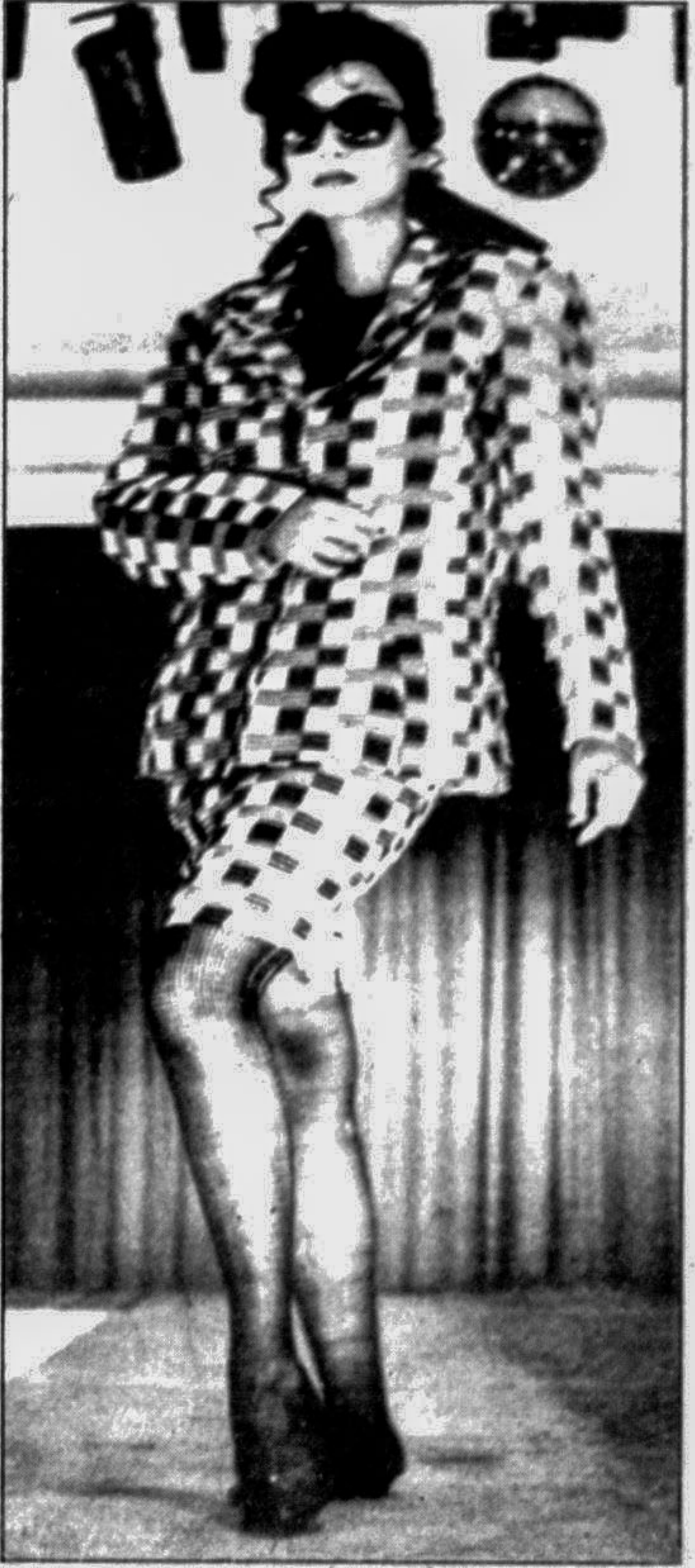
A scene from a Fashion Show held yesterday at Dhaka Sheraton where models displayed dresses styled on a unique blend of western and continental fashion.