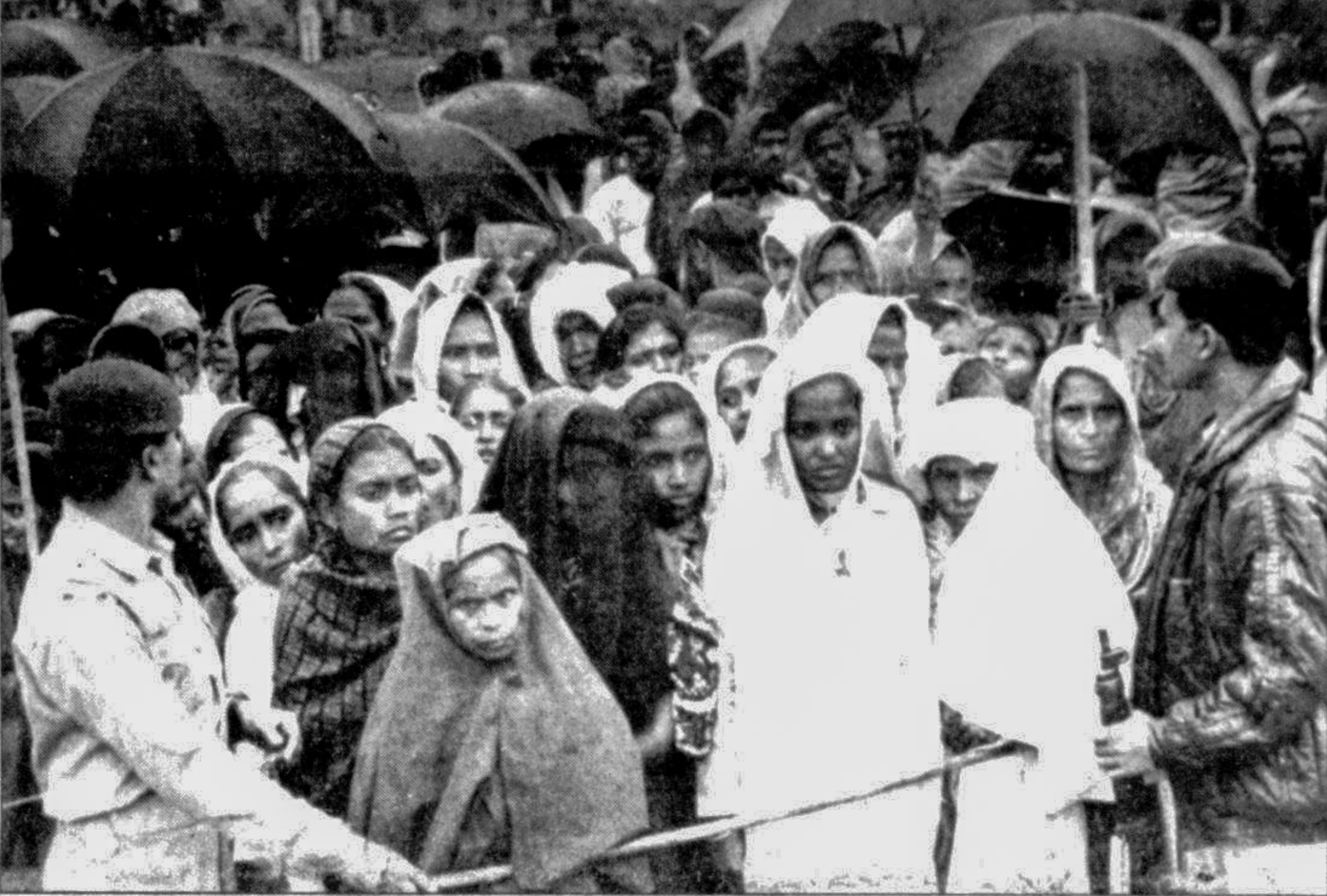
Braving the rains, people hired up to cast their votes yesterday at the Kanchpur Union polling centre in Sonargaon Upazila.

their franchise disregarding dense fog and mild rains since 9 in the morning. Polling continued till 5 pm without any break. Barring the trouble-prone centres, voting was held peacefully. See Page 12 Col 3