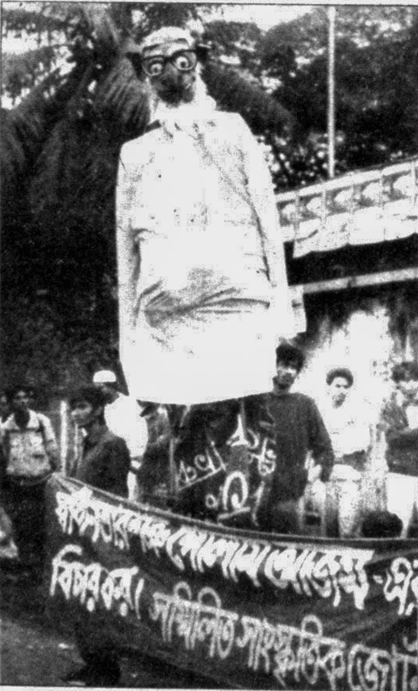
Sammitito Sangskritik Jote demonstrated in the city yesterday demanding trial of Golam Azam. The Jote members also burnt his effigy on the occasion.

CHITTAGONG, Jan 21: A special team of port police recovered some arms and ammunition from Ananda Bazar primary school at Halishahar here last night, police said today, reports BSS. The arms and ammunition which were found inside the room of the school included, one country-made LMG one pipe-gun, two bayonets and eight round of cartridges. Police said that some miscreants were using the arms for dacoity and hijacking. The miscreants fled away from the spot when they learnt of the arrival of police. Chandgon police recovered one SBL, one country-made LMG, two crackers, two daggers, one VCR, one TV and arrested two persons from Afghan Masjid area DC road today. Kotwali police recovered one colour TV, one VCR and some electronic goods from Terri Bazar area and arrested three persons in this connection.