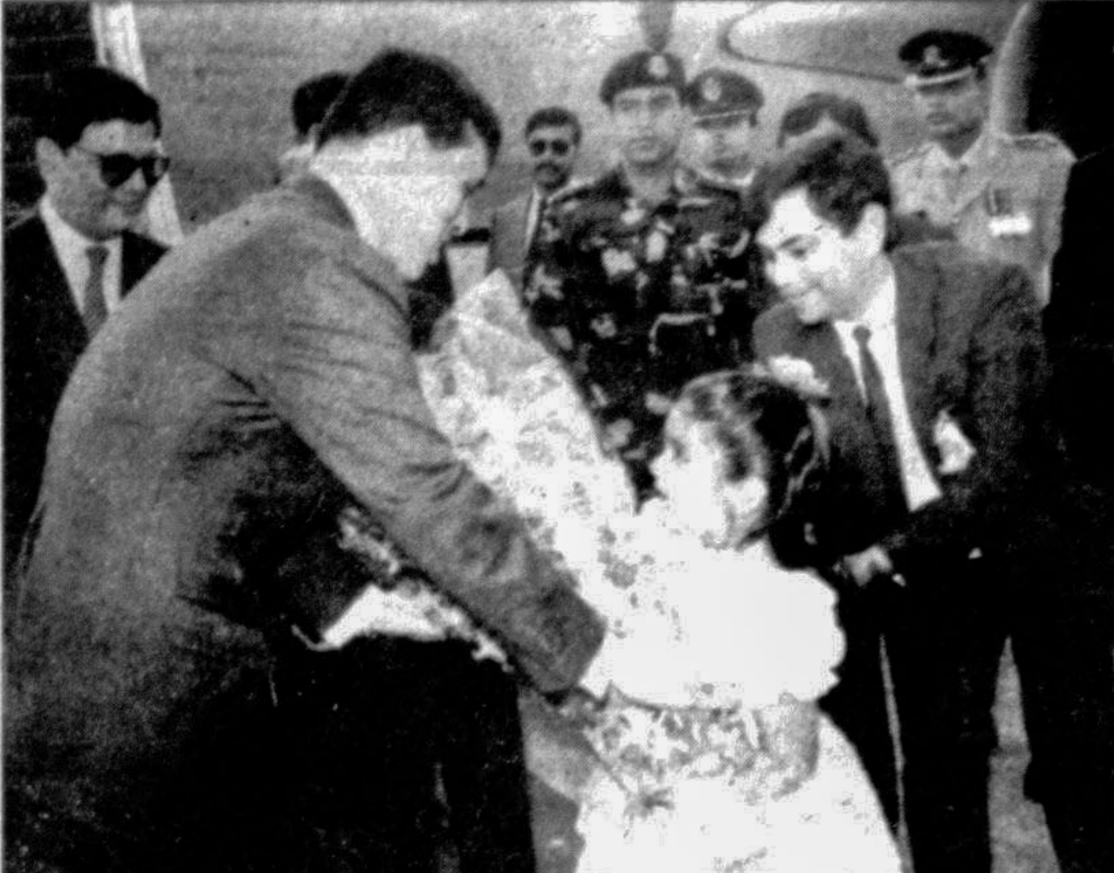
A little girl presenting a flower bouquet to the Thai Crown Prince Maha Vajiralongkorn on his arrival at Zia International Airport yesterday.