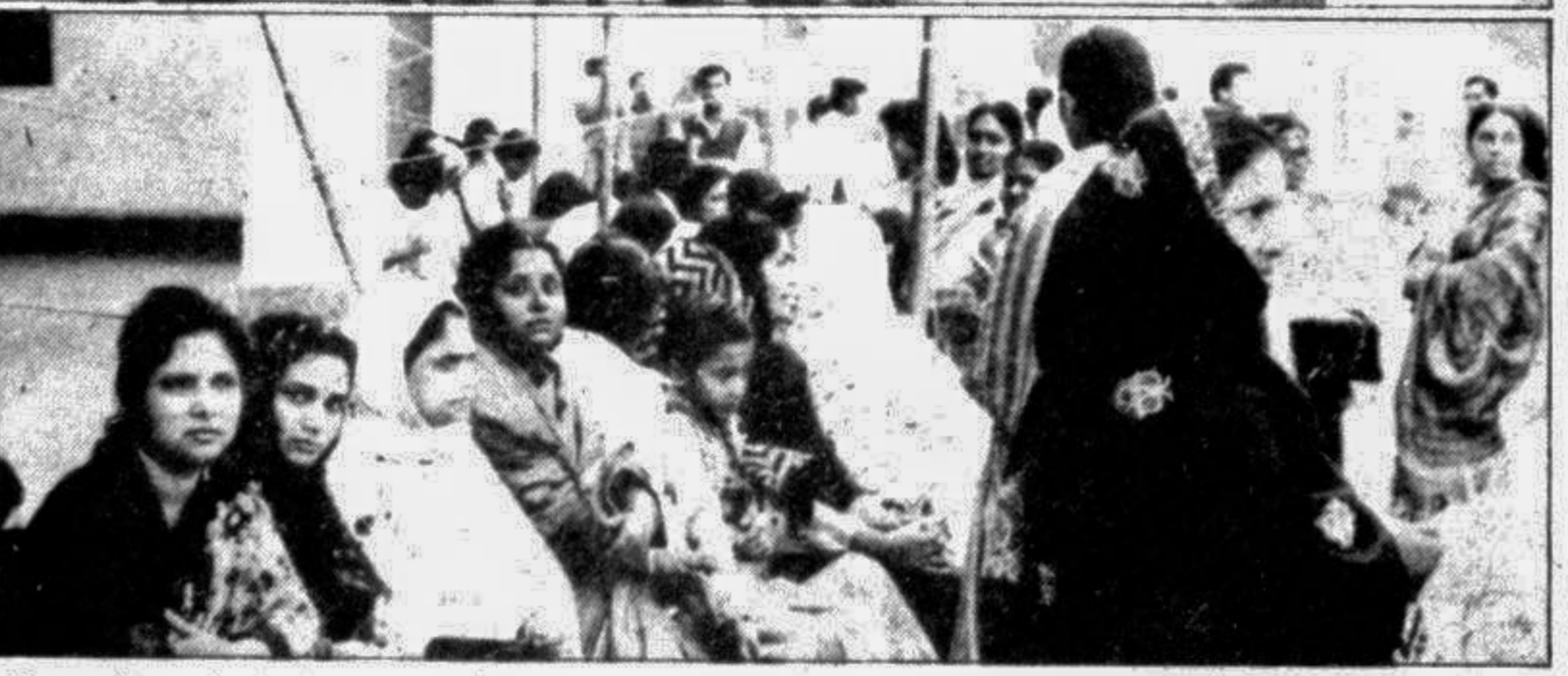
Tests for admission into city's government schools began yesterday (top) and anxious mothers waiting outside school premises (above).