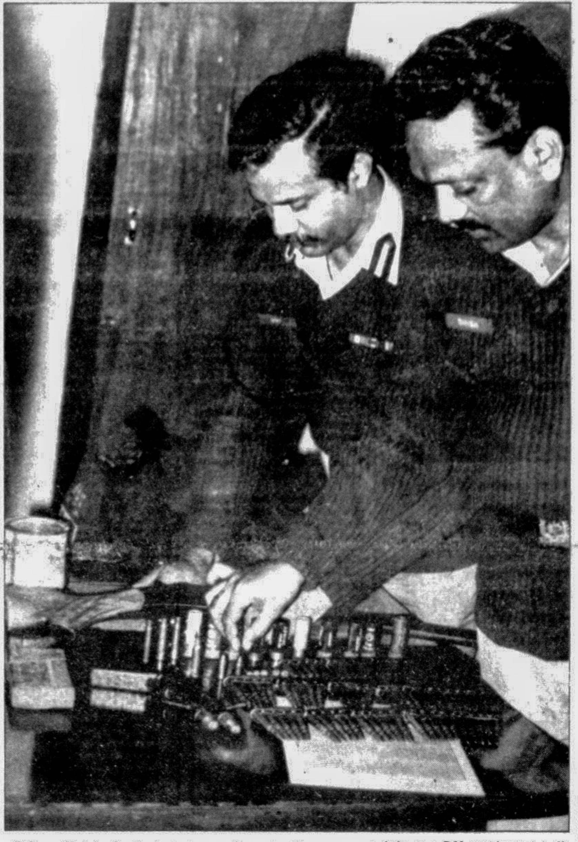
Police officials displaying arms and ammunition recovered from a DU residential hall yesterday.

Foreign Minister ASM Mostafizur Rahman will make a statement in parliament today on the present tension along Bangladesh-Myanmar border triggered by the Burmese troops buildup, reports UNB. The Burmese border security forces made a surprise attack on the BDR outpost at Rezupara in Bandarban district on December 21, killing one BDR personnel and injuring seven others. Intruders took away all arms and ammunition from the camp. Soon after the incident, Dhaka protested to Yangon against violation of the international border by the Burmese troops, killing and