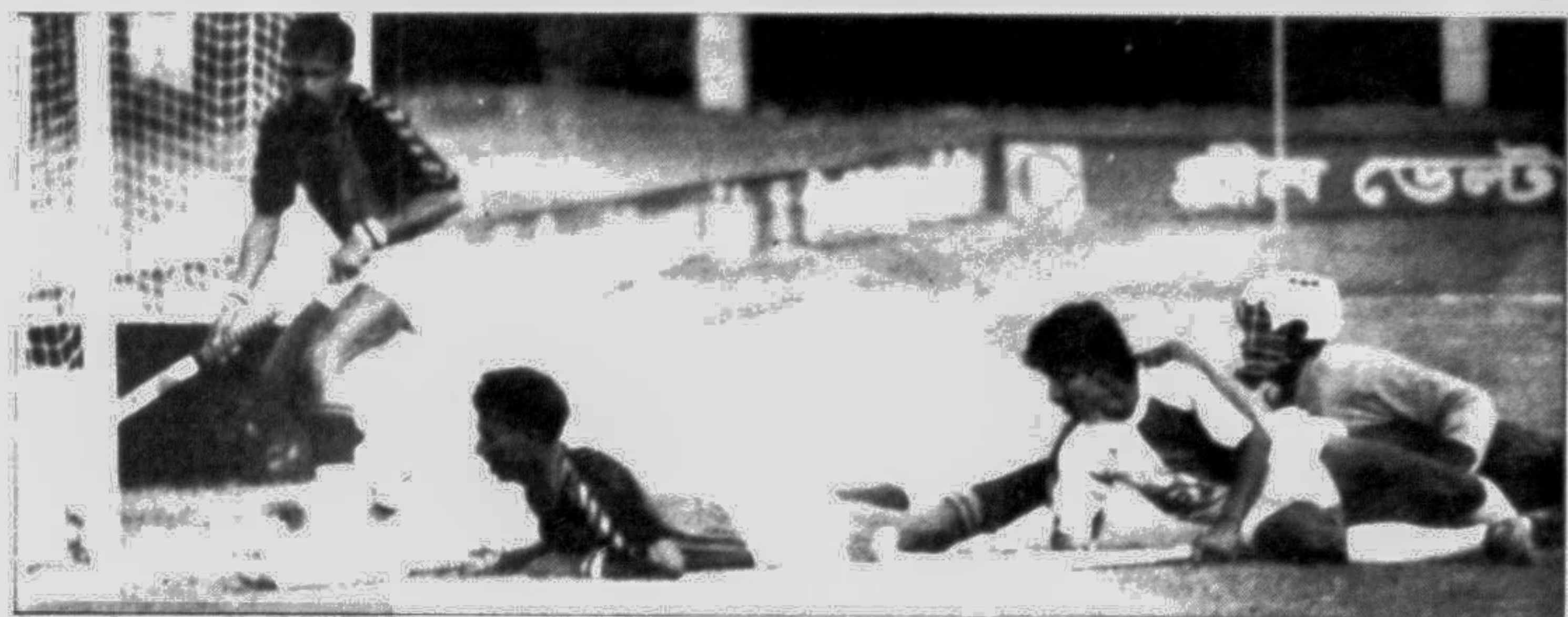
OH, NO! Four Dhaka Ansars players watch the ball enter their net during yesterday's Green Delta First Division league match against Ajax Sports Club at the Hockey Stadium. Ajax won 3-0.

TODAY'S MATCHES Muktijoddha Sangsad vs Dhanmondi Club (3 pm) PWD SC vs BJMC SC (5 pm)