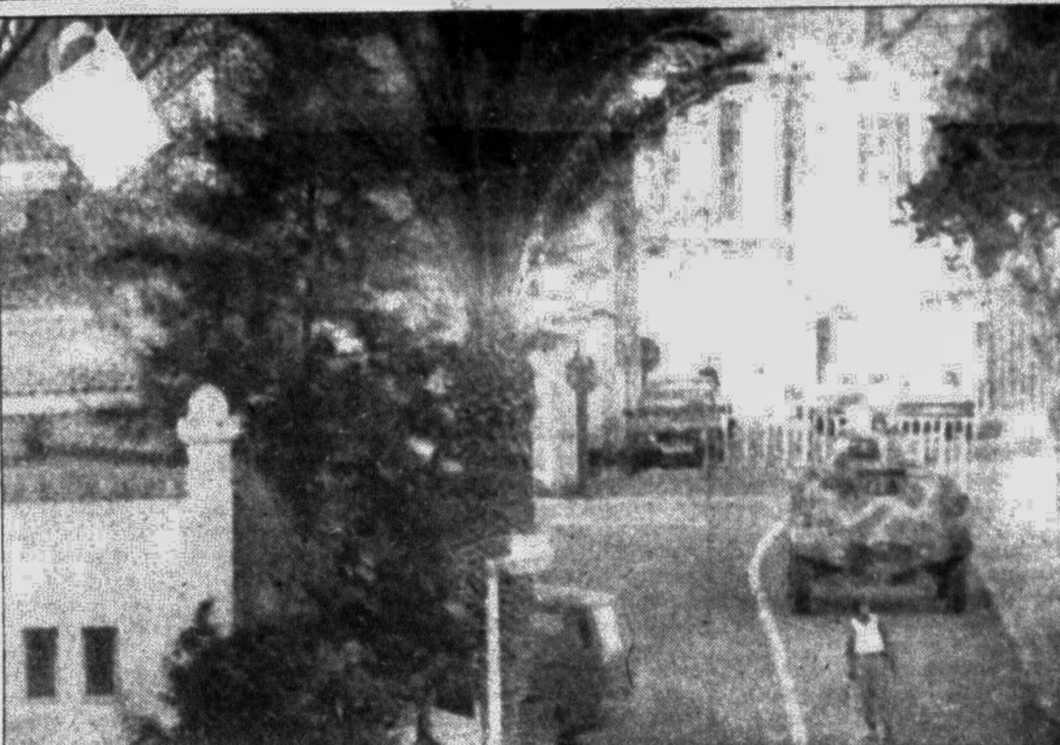
An armoured vehicle takes position in front of the presidential palace in Algiers yesterday after the surprise resignation by Algerian President Chadli Bendjedid on Saturday.