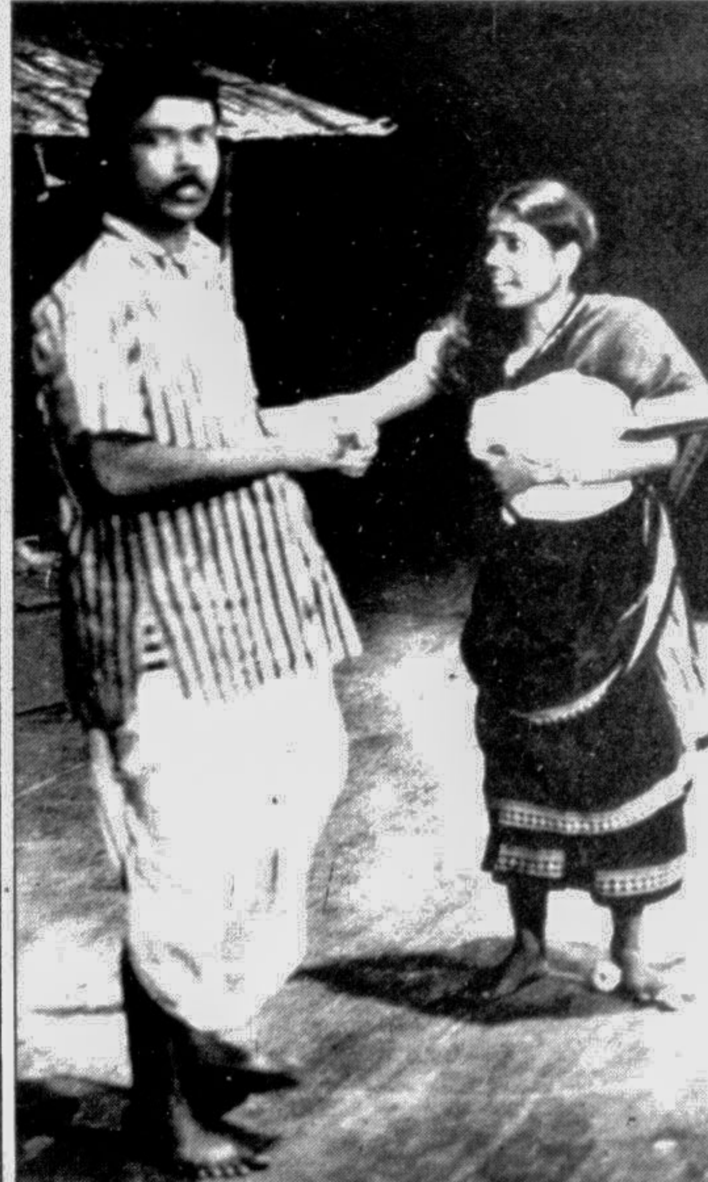
Nandanik, a theatre group yesterday participated in the on-going drama festival in the city with Tagores 'Shasti'.

All members of the committee have been requested to attend the meeting in time.