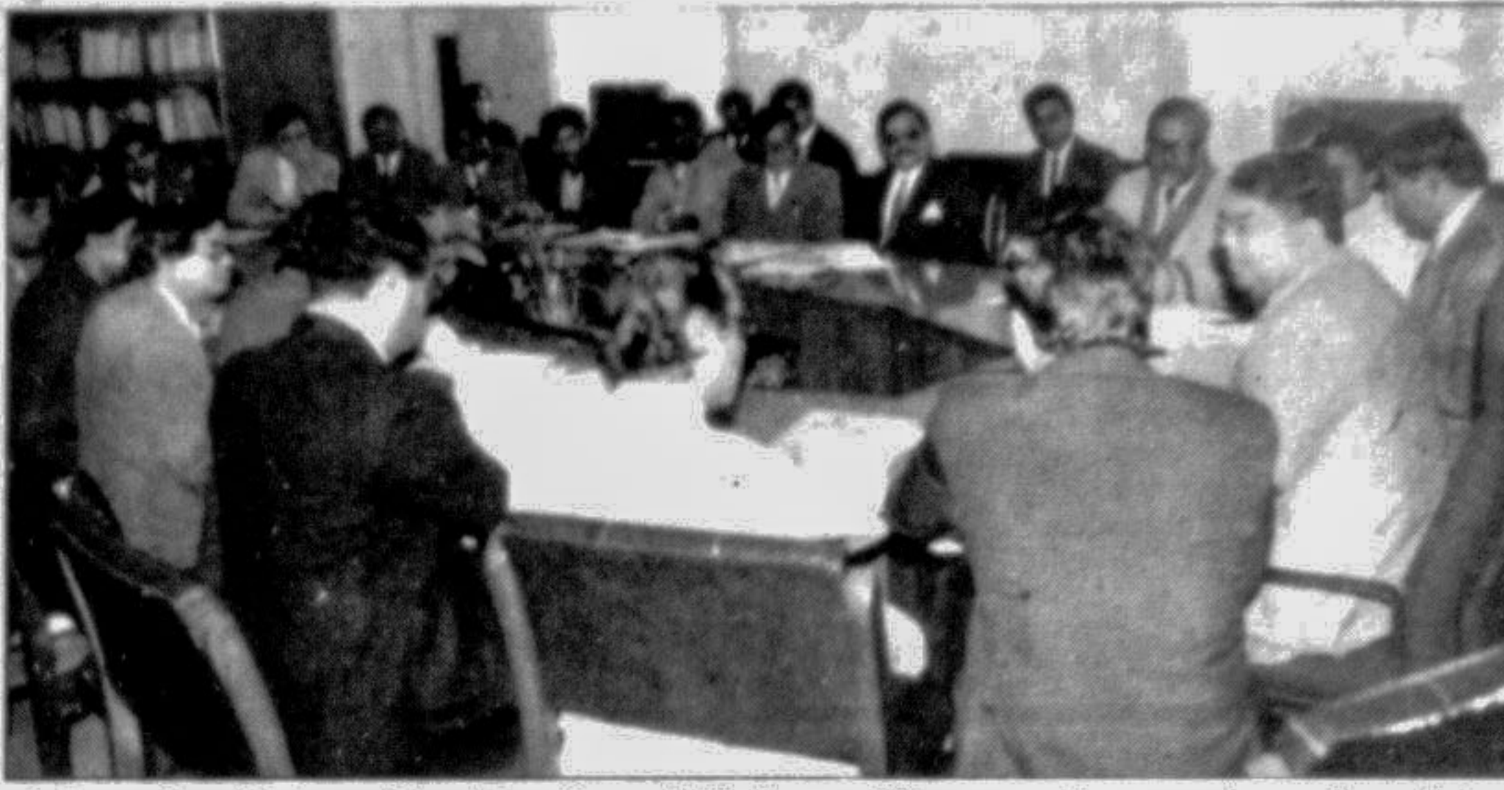
Information Minister Barrister Nazmul Huda presiding over the second meeting of the canal digging programme of Dhaka district at the auditorium of the Information Ministry yesterday.