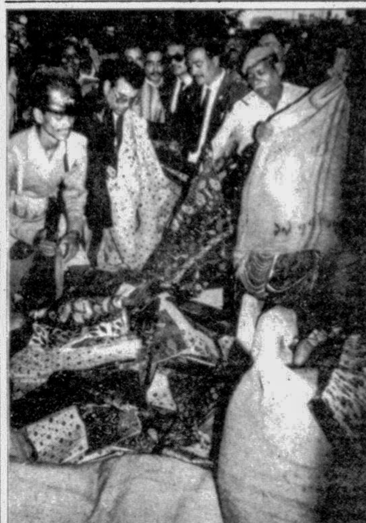
A task force team recovering smuggled sarces from Bangabazar Market in the city yesterday.