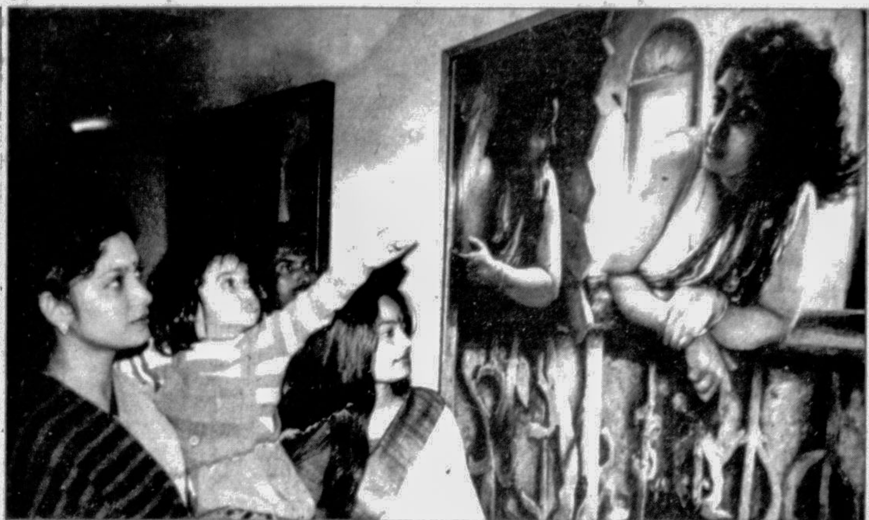
Visitors at the exhibition of contemporary Indian art at the Shilpakala Academy in the city yesterday.

PANI-387/91-92 Executive Engineer DFP(G)-16054-30/12 Natore Water Development Division G-22 BWDB, Natore.