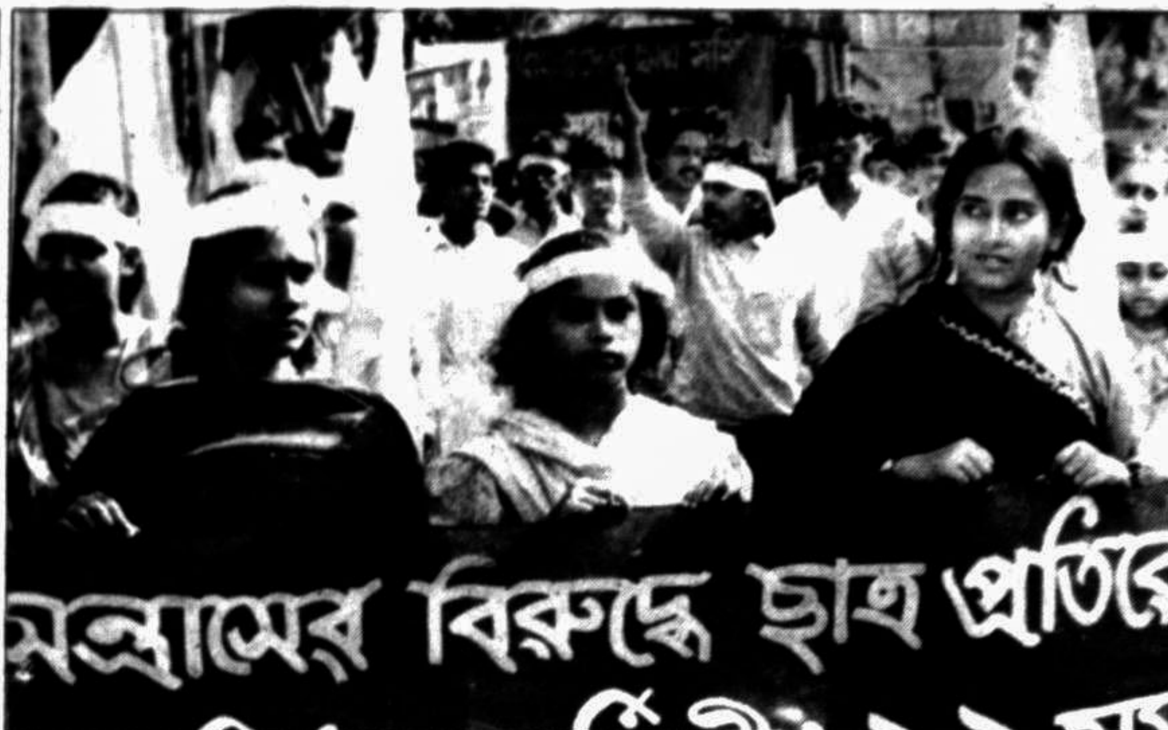
Bangladesh Chhatra Samity holding a colourful rally Saturday on the occasion of its 15th founding anniversary.