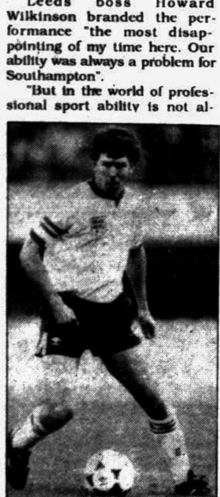
BRYAN ROBSON .. injured