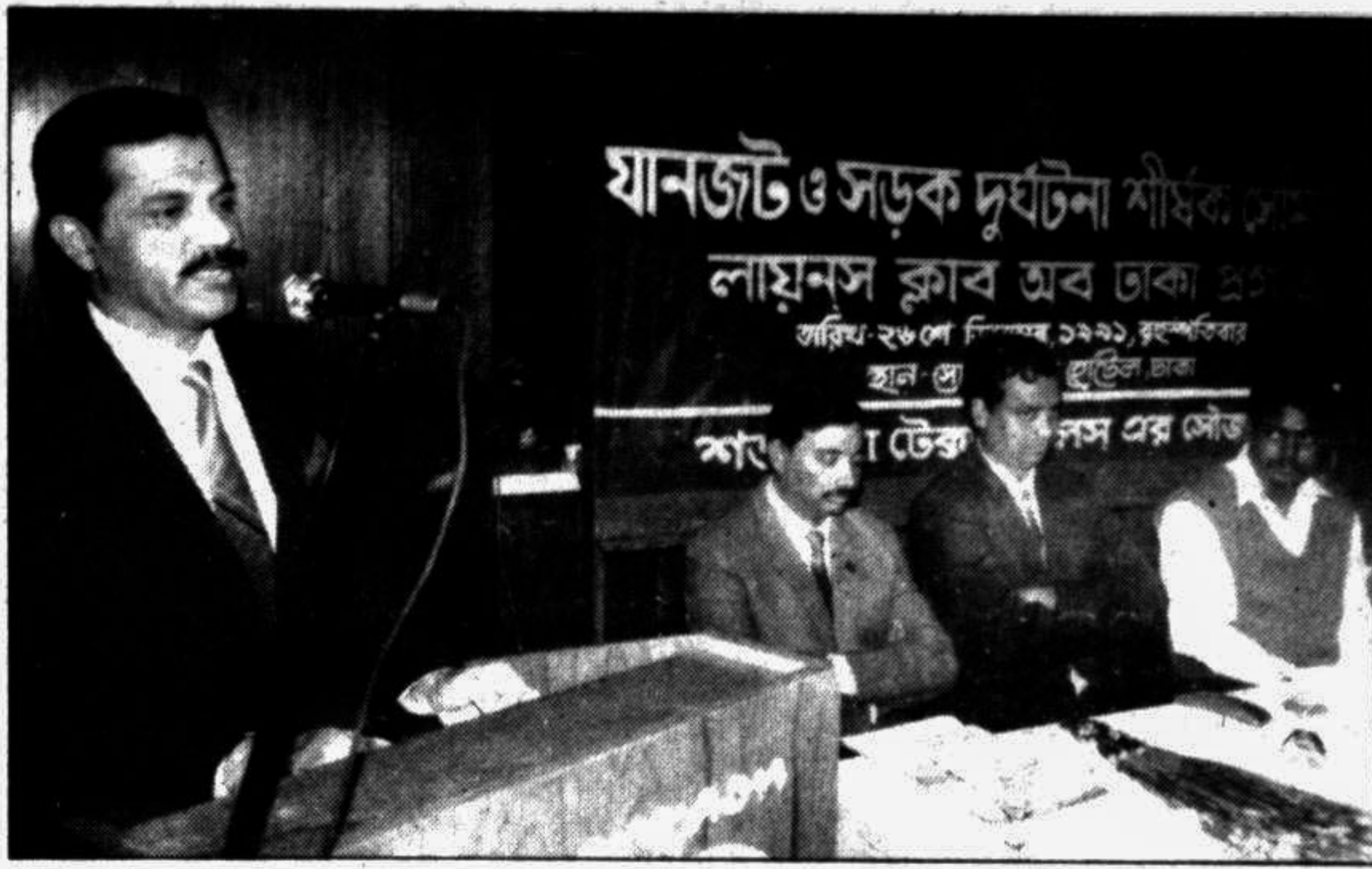
Ashraf Huda, DMP Commissioner, addressing a seminar on 'traffic jam and road accident' at a local hotel in the city.