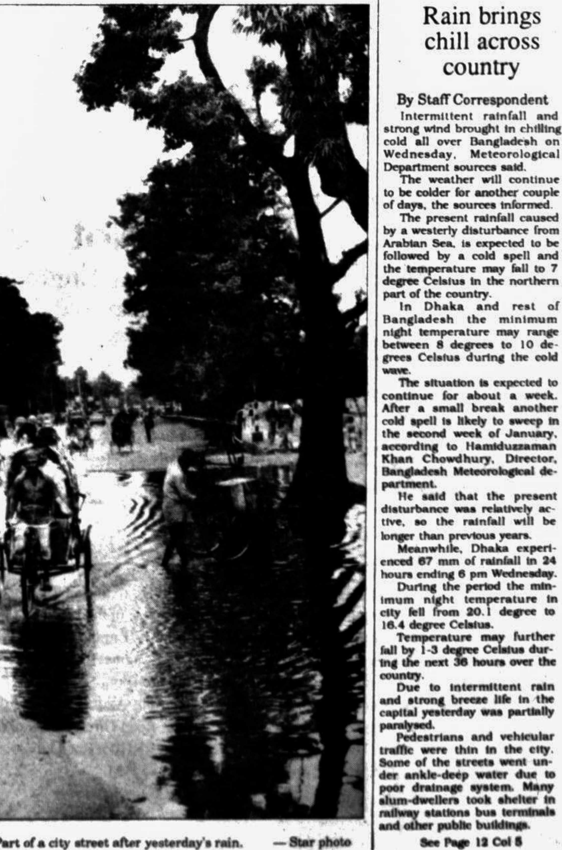
Part of a city street after yesterday's rain.