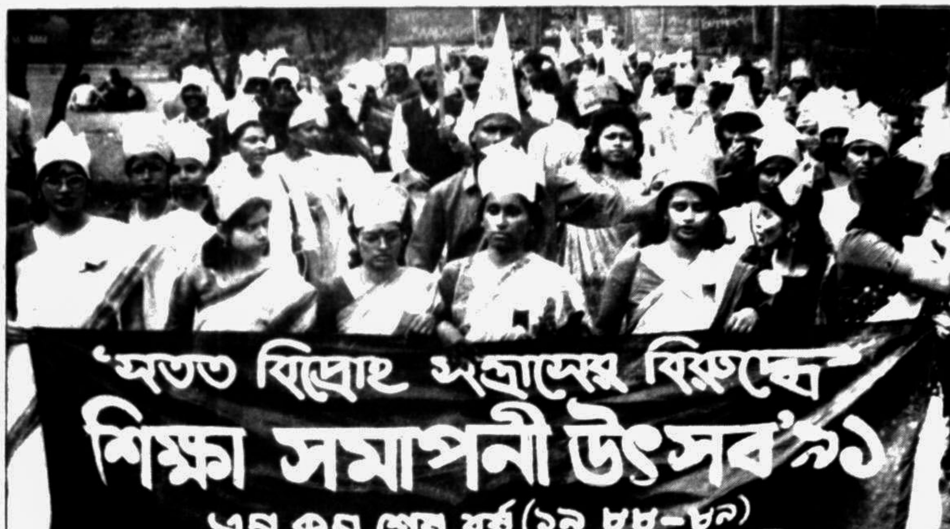
The final year students of DU Marketing Department brought out a colourful procession in the city on Tuesday on the occasion of their course ending ceremony.