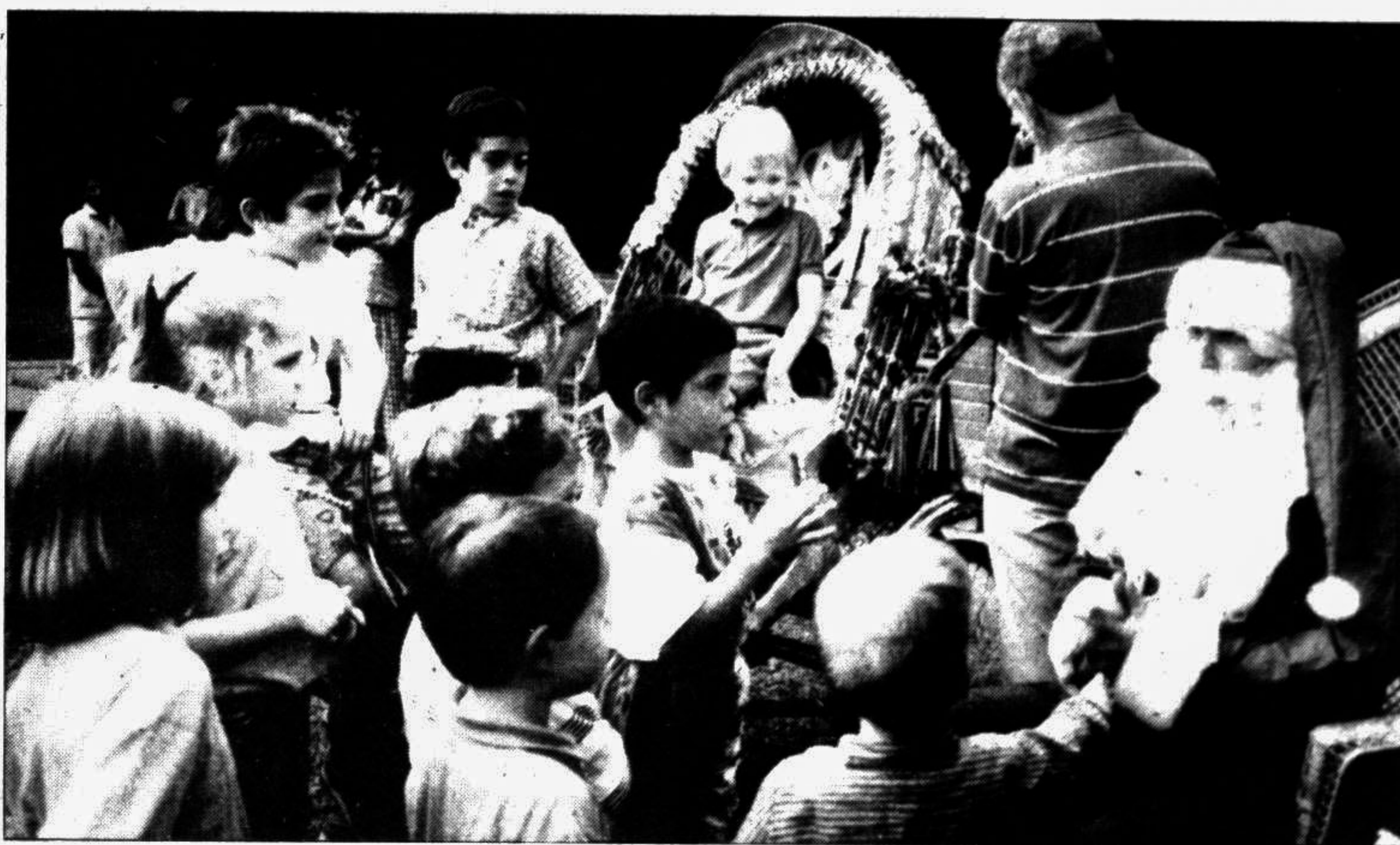
CHRISTMAS is round the corner. And while Santa Claus will be coming with his sackful of goodies riding on a reindeer sledge across the snowy slopes, here in the warmer clime of Bangladesh Father Christmas often rides a rickshaw. Scene from the Christmas programme at the Australian Club in Gulshan.