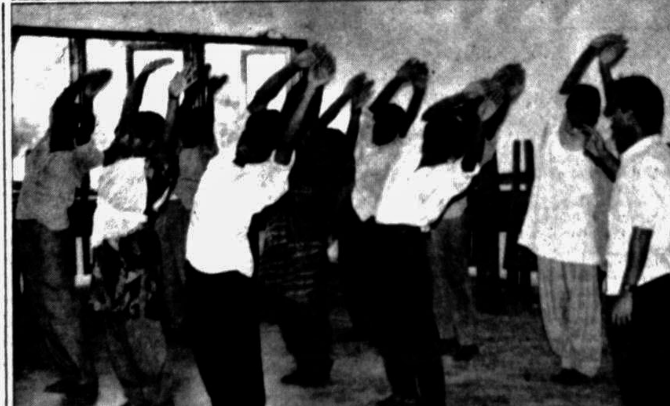
RAJSHAHI: A drama workshop. Samakal Natyo Chakra of Rajshahi University (RU) organised it recently.