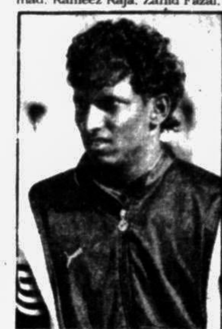
ARAVINDA DE SILVA

PAKISTAN (from): Imran Khan (Capt), Shoaib Mohammad, Rameez Raja, Zahid Fazal.