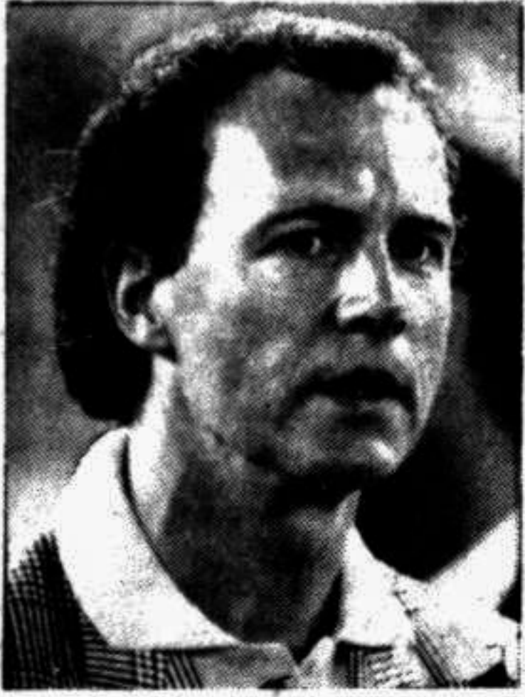
FRANZ BECKENBAUER Netherlands, were pitched into battle once again, reports Reuter.

NEW YORK, Dec 9: The draw for the 1994 World Cup qualifiers produced a worrying scenario on Sunday when the two nations with the worst hooligan problems, England and the