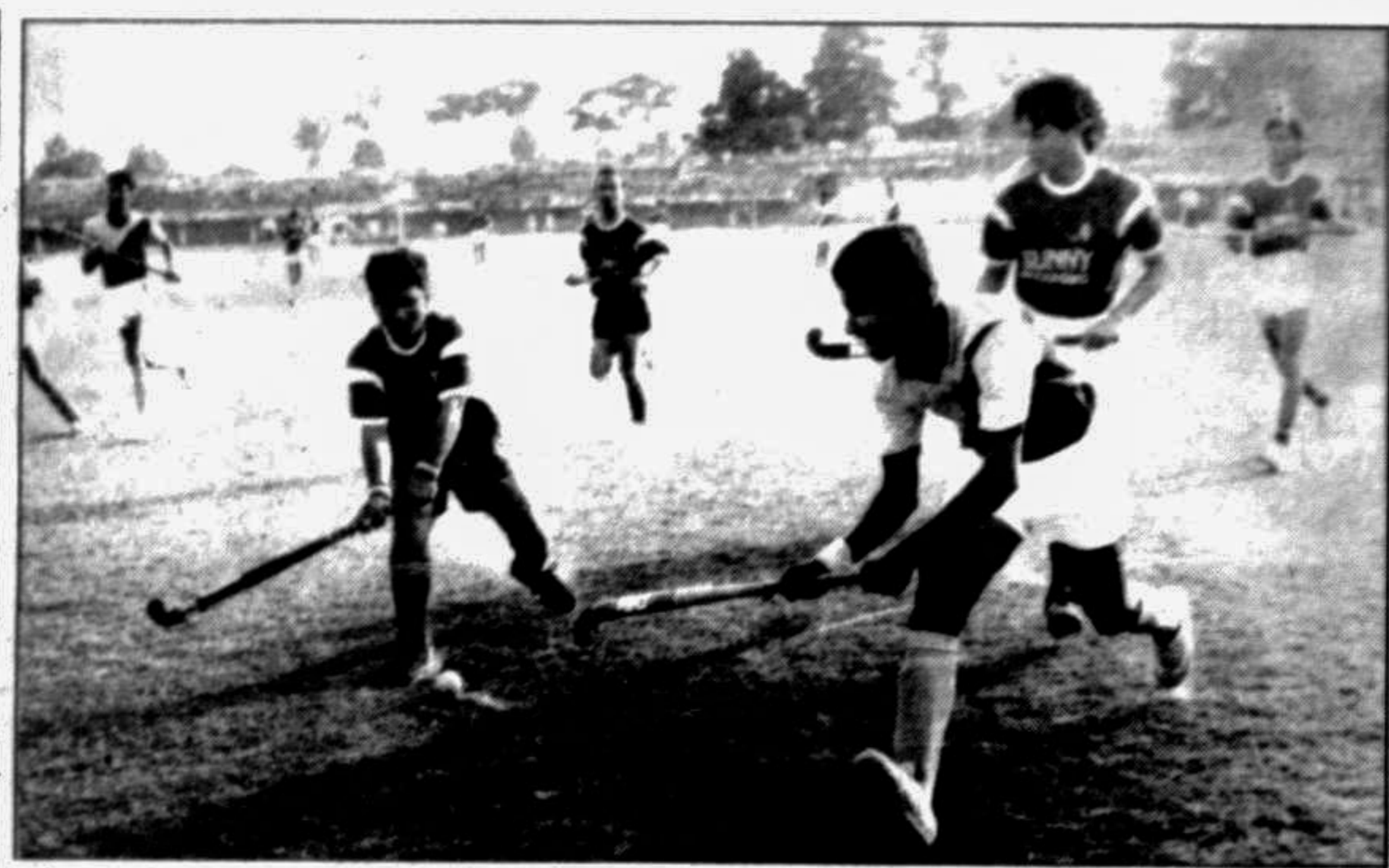
Action from yesterday's Green Delta Second Division hockey super league match between Shishu Kishore Shingha and Cantonian Club held at the Dhaka Hockey Stadium.