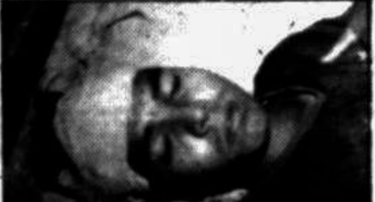
Three of the students injured in clash at Adarsha College yesterday.