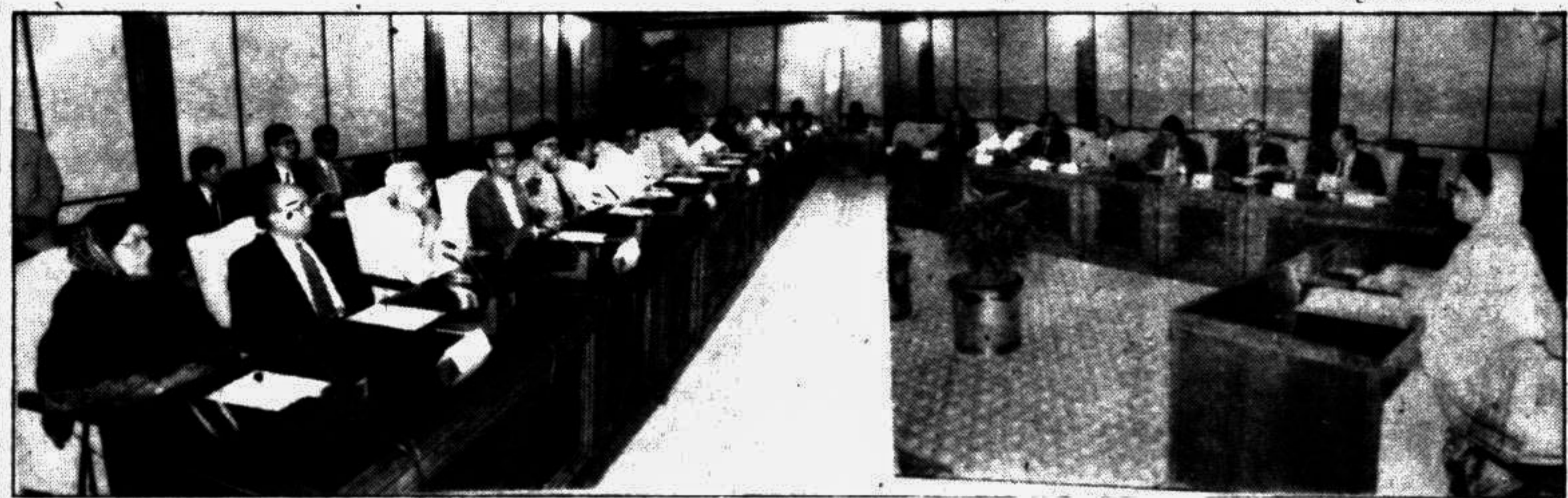
Prime Minister Begum Khaleda Zia presiding over a meeting of all major political parties on the campus violence.